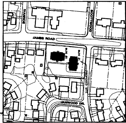
1/100"=1'-0" SITE LOCATION