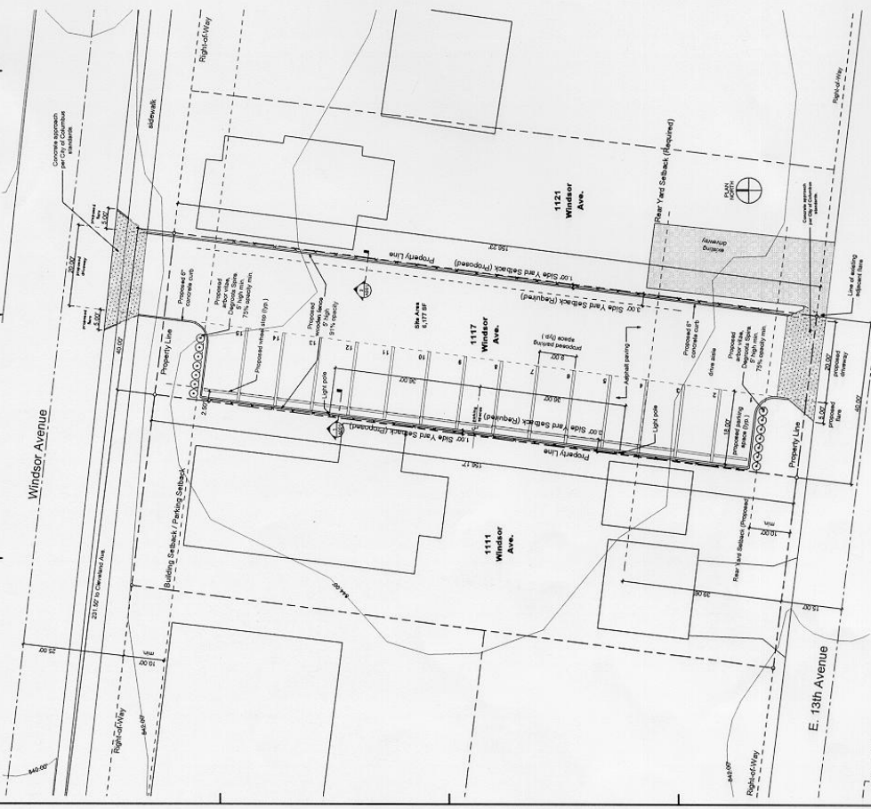
Site Plan 1" = 10' 0"