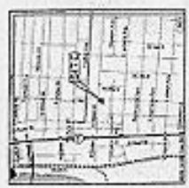
Location Map 1/16/19