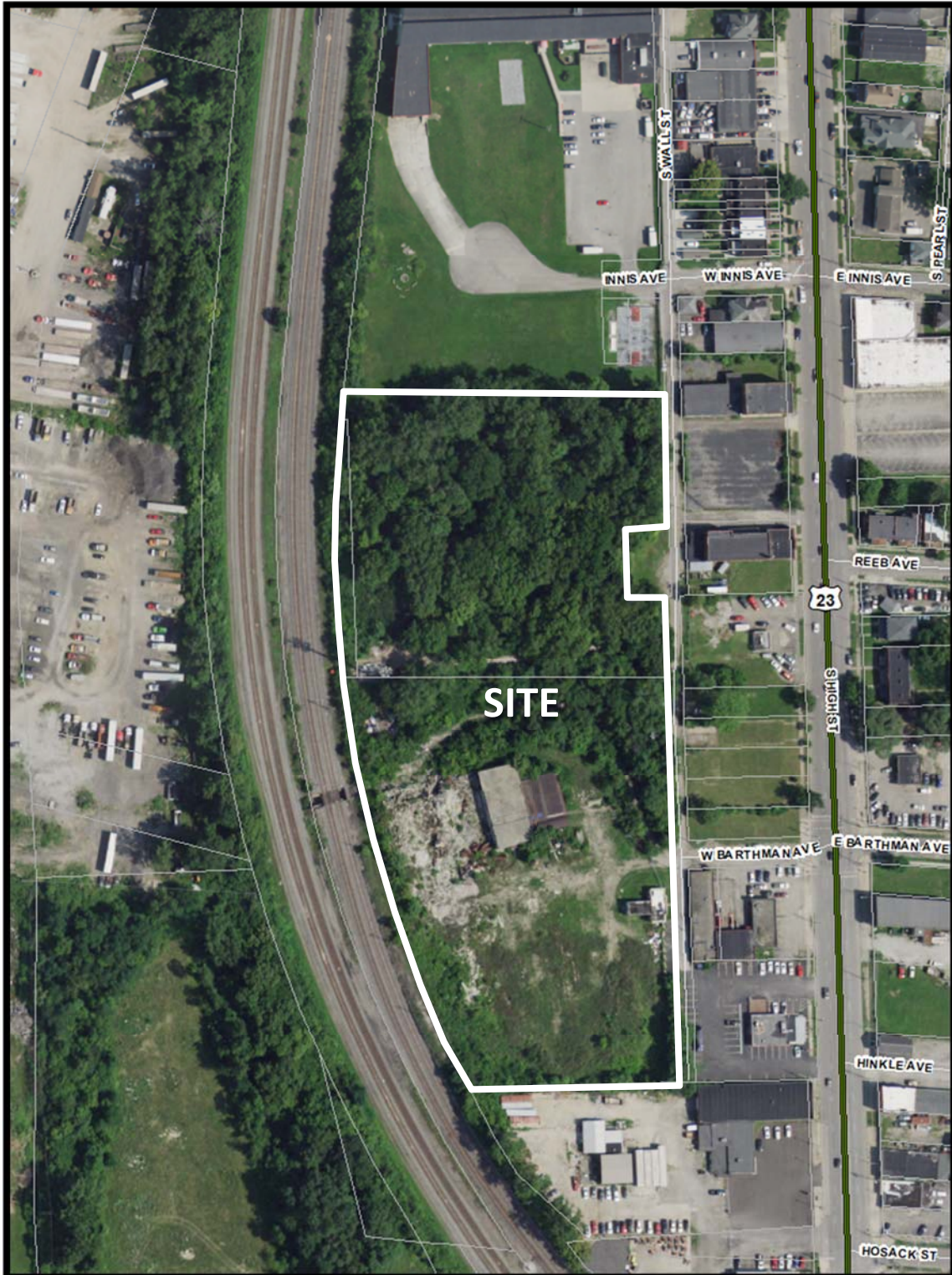
CV23-029 45 W. Barthman Ave. Approximately 8.15 acres