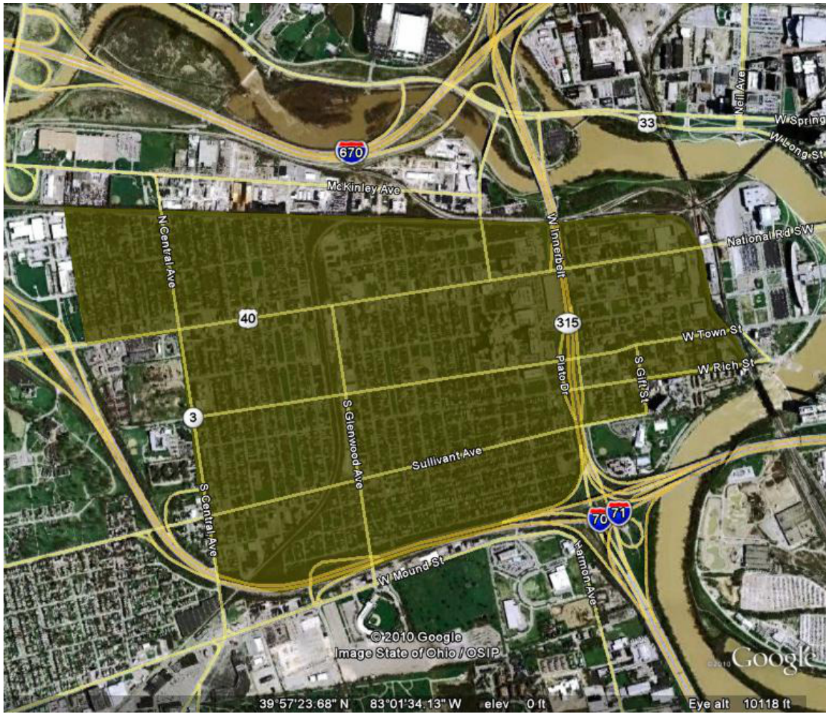
Franklinton Area of Greatest Need