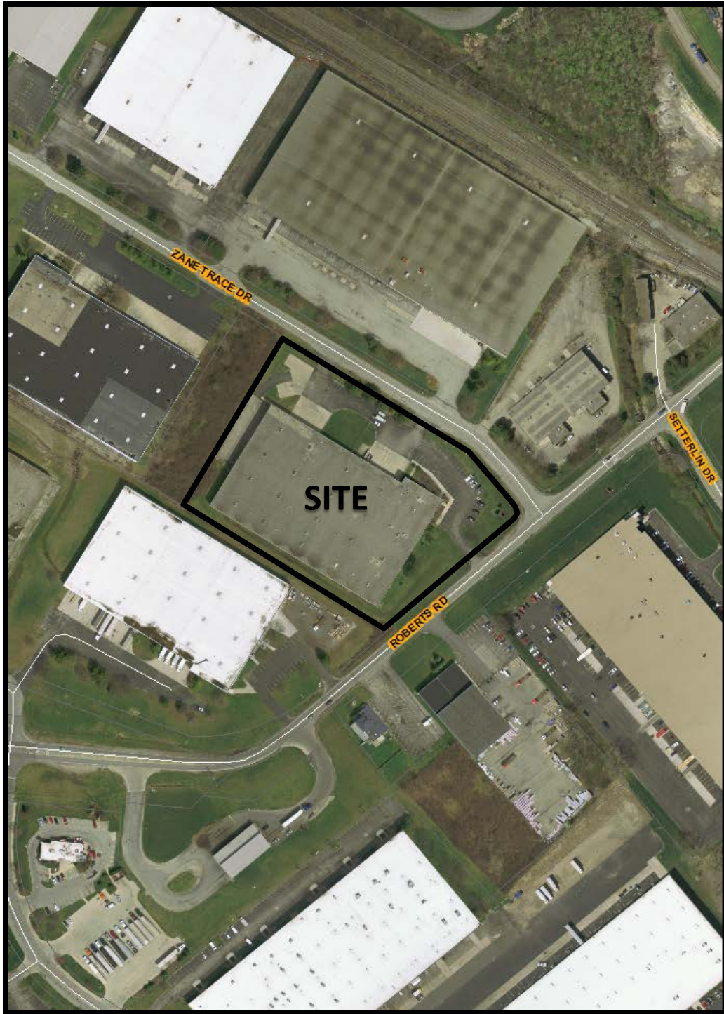
CV16-081 3635 Zane Trace Drive Approximately 5.24 acres