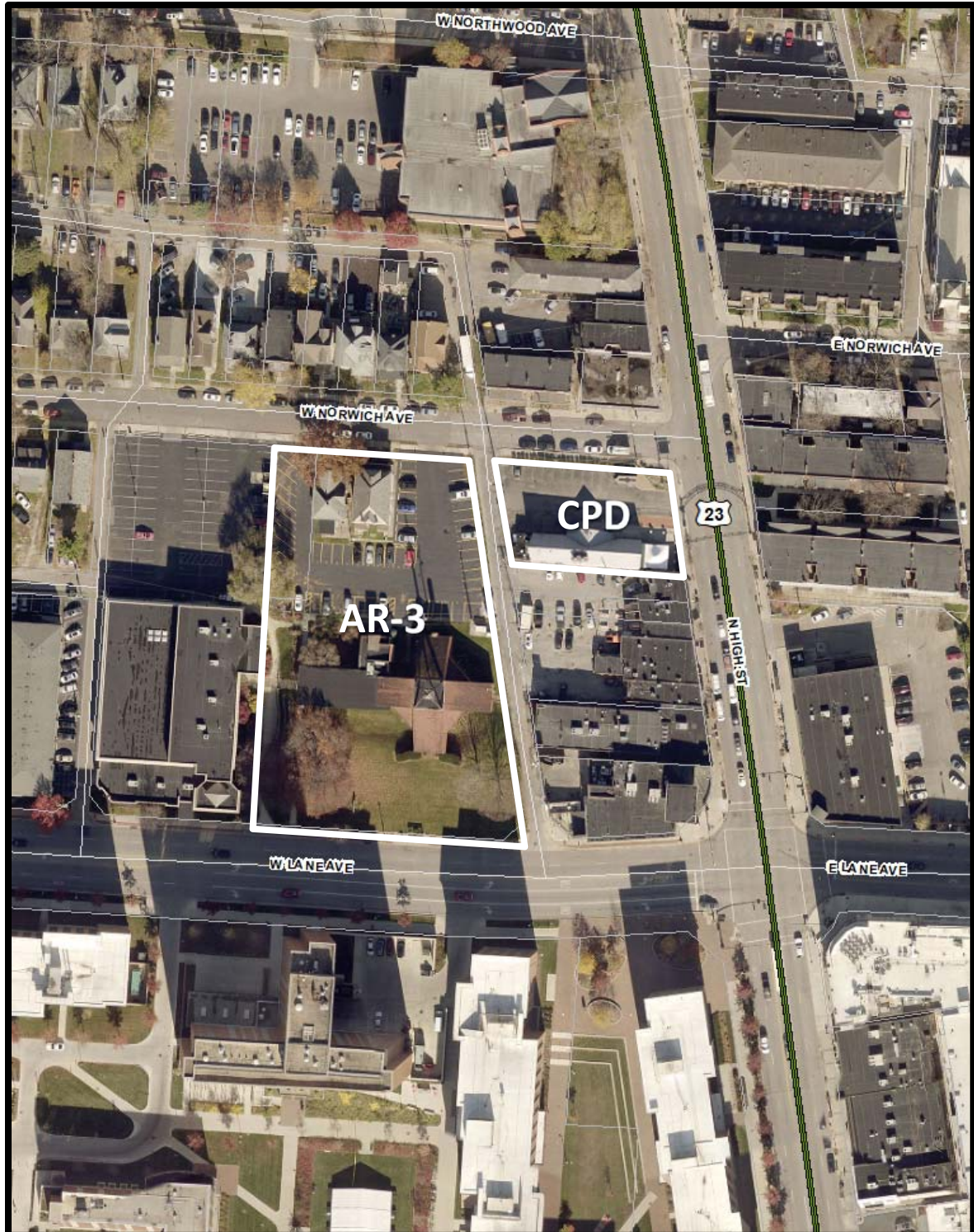
Z22-065 50 W. Lane Ave. Approximately 1.72 acres AR-4, R-2F & C-4 to AR-3 & CPD