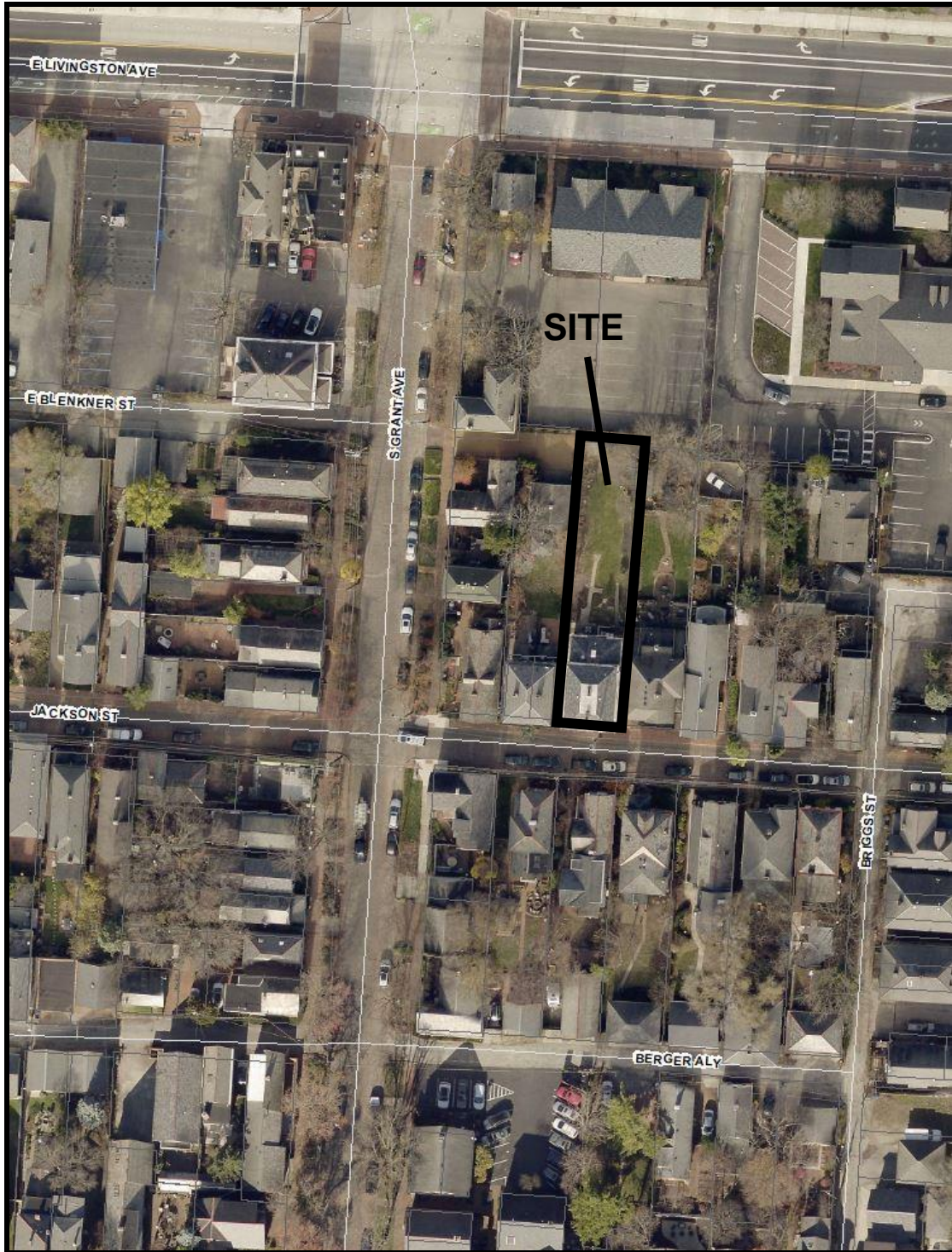
CV22-012 360 Jackson St. Approximately 0.11 Acres