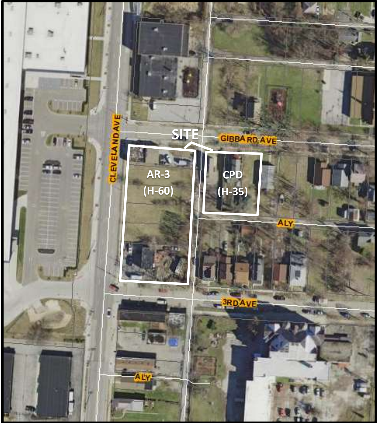
Z20-065 986 Cleveland Ave. Approximately 1.07 acres C-4, R-4 to AR-3, CPD