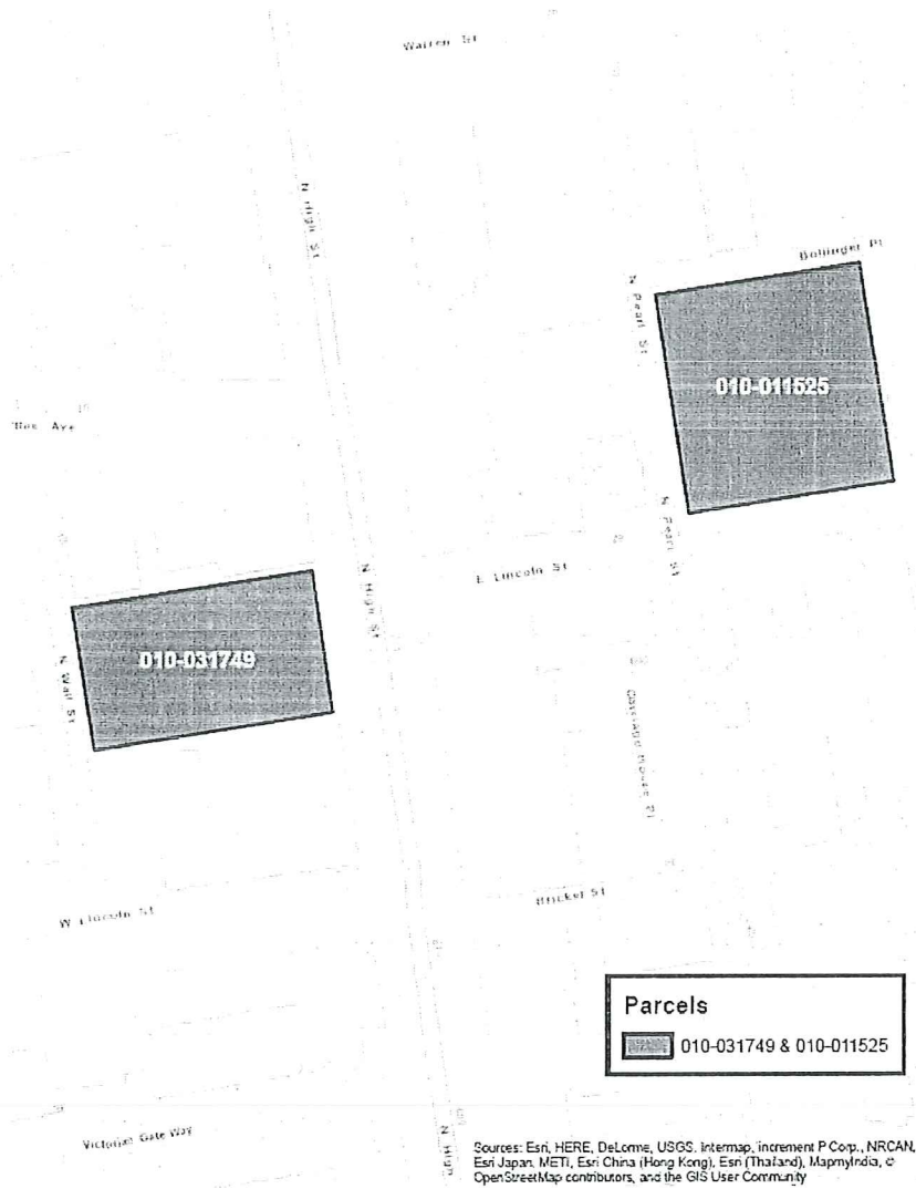
Map of the Special Benefit District