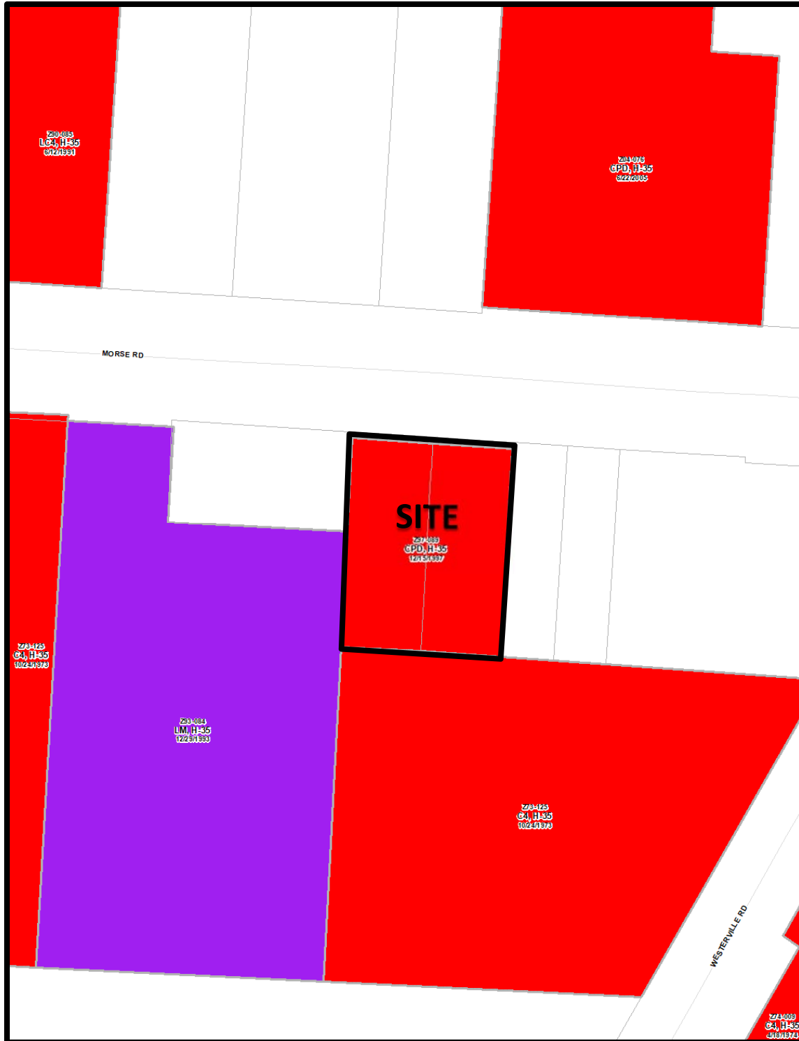
Z23-068 2995 Morse Rd. Approximately 0.69± acres CPD to CPD