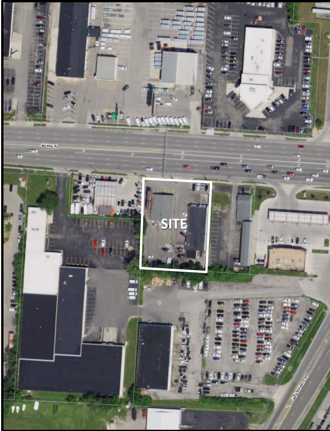
Z23-068 2995 Morse Rd. Approximately 0.69± acres CPD to CPD