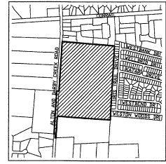
LOCATION MAP AND BACKGROUND DRAWING NOT TO SCALE