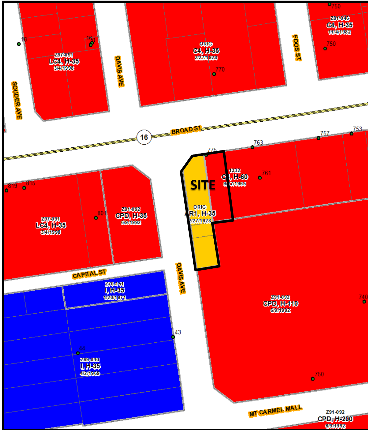
Z18-067 775 West Broad Street Approximately 0.2 acres AR-1 & C-4 to C-3