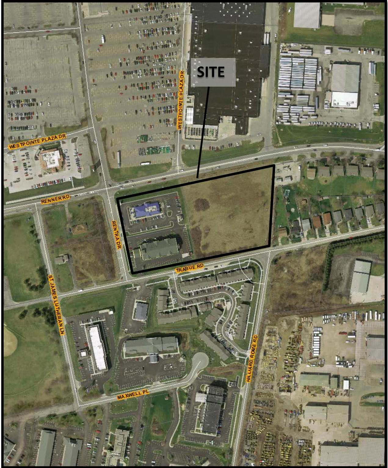
Z97-027A 5500 Trabue Road Approximately 6.48 acres