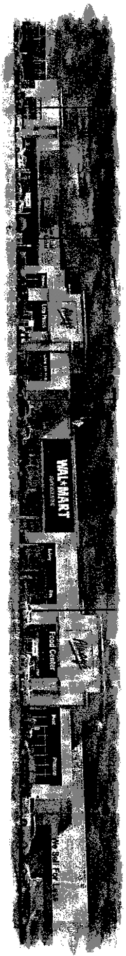
FRONT PERSPECTIVE (N.T.S.)