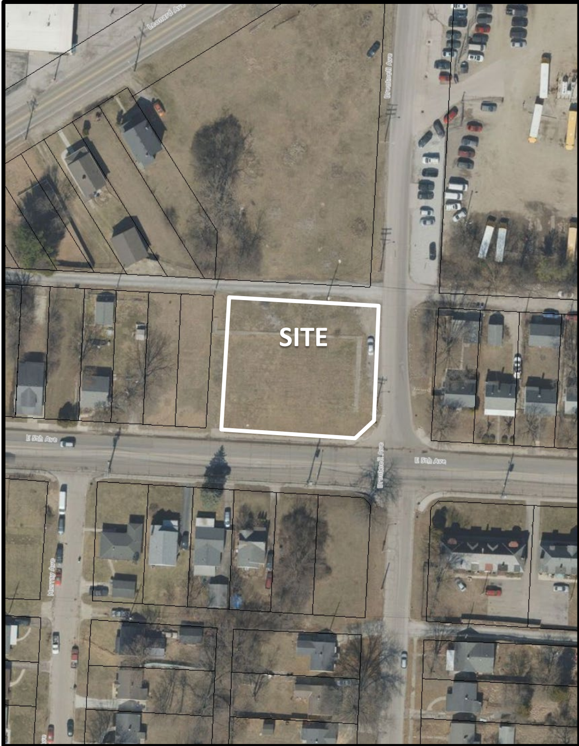
CV26-030 2006 E. 5th Ave. Approximately 0.44 acres