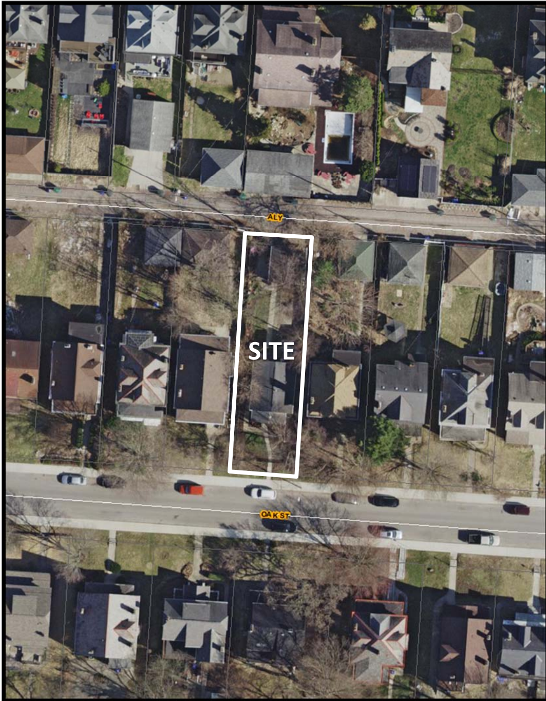
CV21-050 1816 Oak St. Approximately 0.14 acres