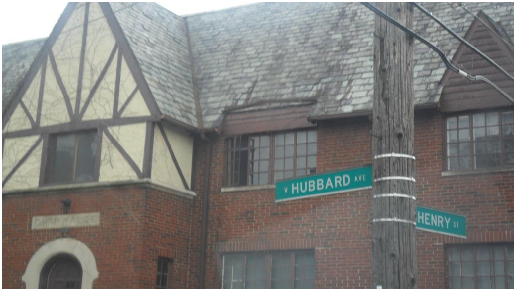
791-833 Henry Street