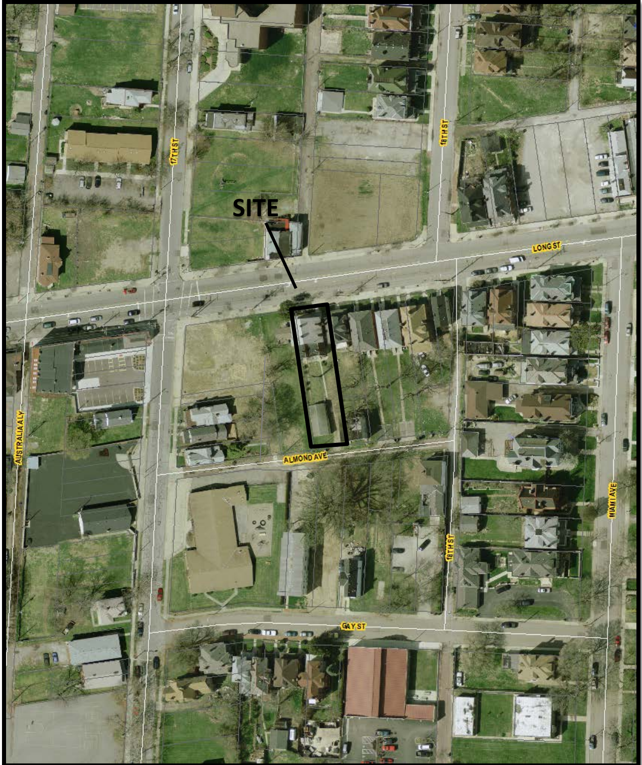
CV14-046 923 East Long Street Approximately 0.21 acres