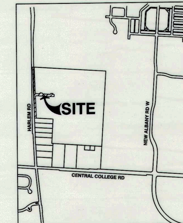
VICINITY MAP SCALE: 1"=1,500'

STATE OF OHIO, COUNTY OF FRANKLIN, CITY OF COLUMBUS, SECTION 7, TOWNSHIP. 2, RANGE 16, UNITED STATES MILITARY LANDS