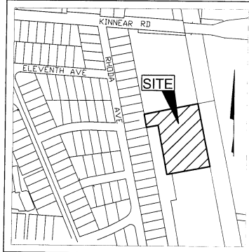
LOCATION MAP AND BACKGROUND DRAWING NOT TO SCALE

The total perimeter of the annexation area is 1,406 feet, of which 325 feet is contiguous with the City of Columbus, giving 23% perimeter contiguity.