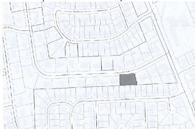
Location map not to scale

Prepared by: Josh Kluehn Date: 10/06/2023