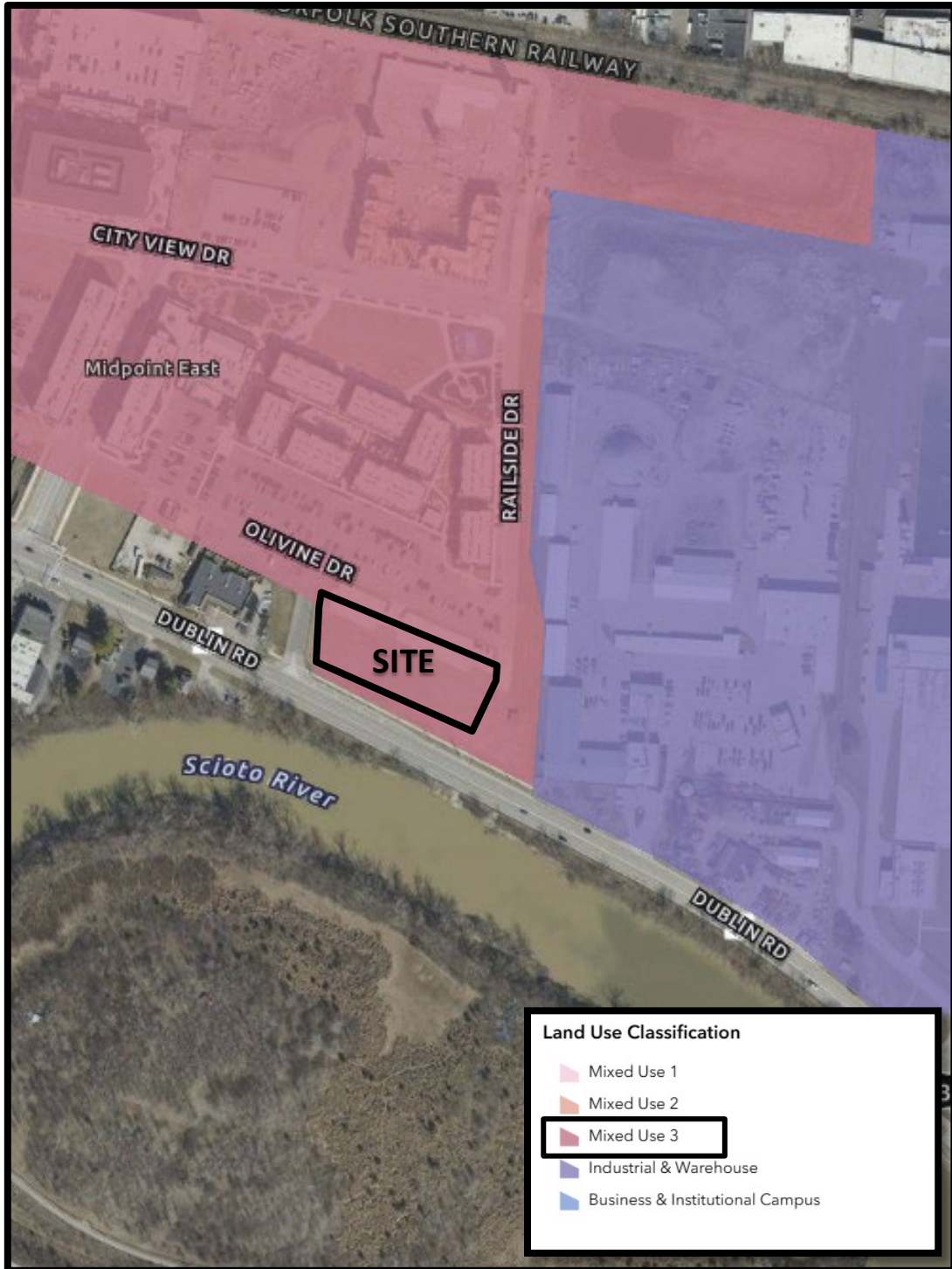
Columbus Growth Strategy (2026)

CV26-027 988 Dublin Rd. Approximately 1.23± acres