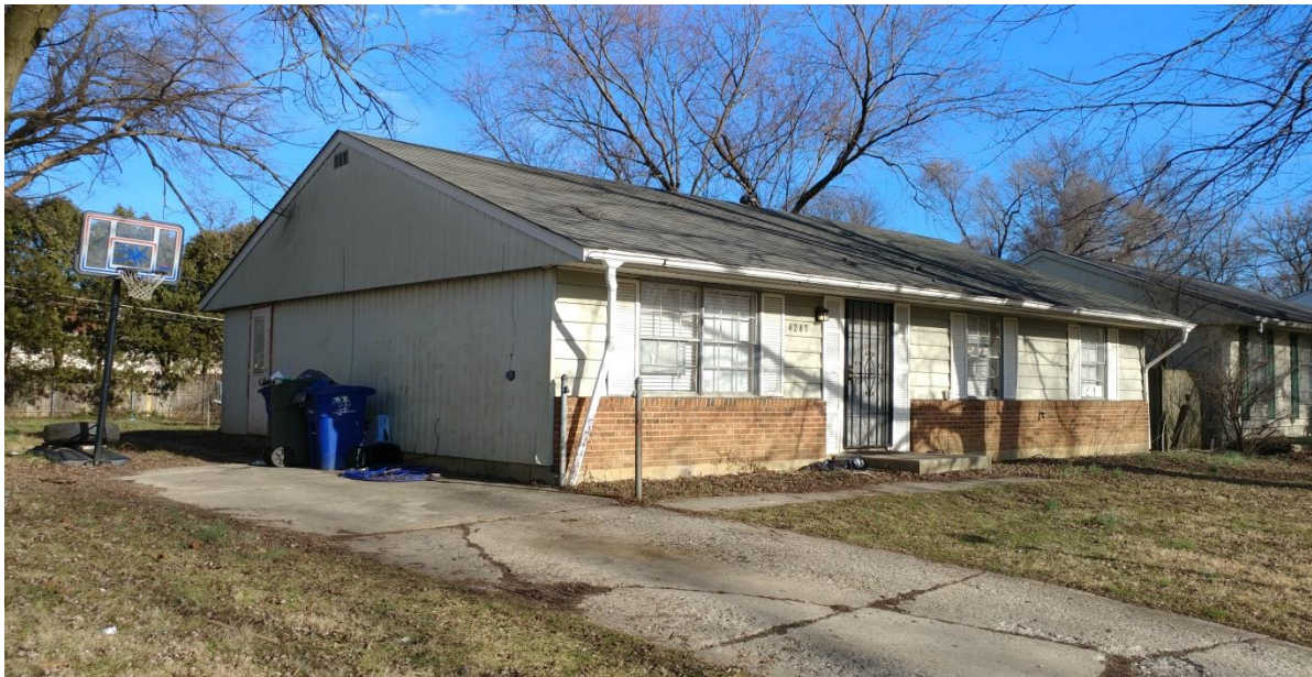
4247 Arbury Road

* Photos were taken during the months of January and February 2017