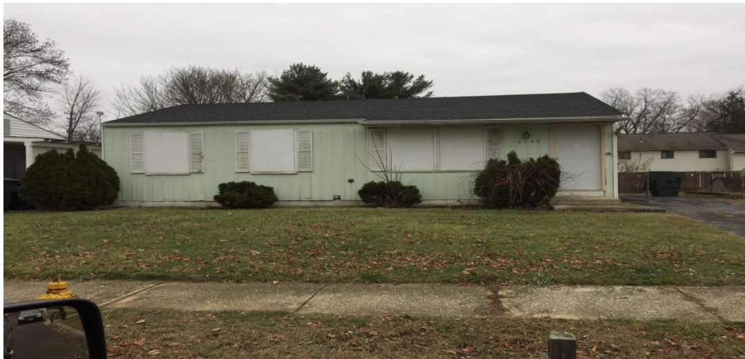
4122 Commodore Street