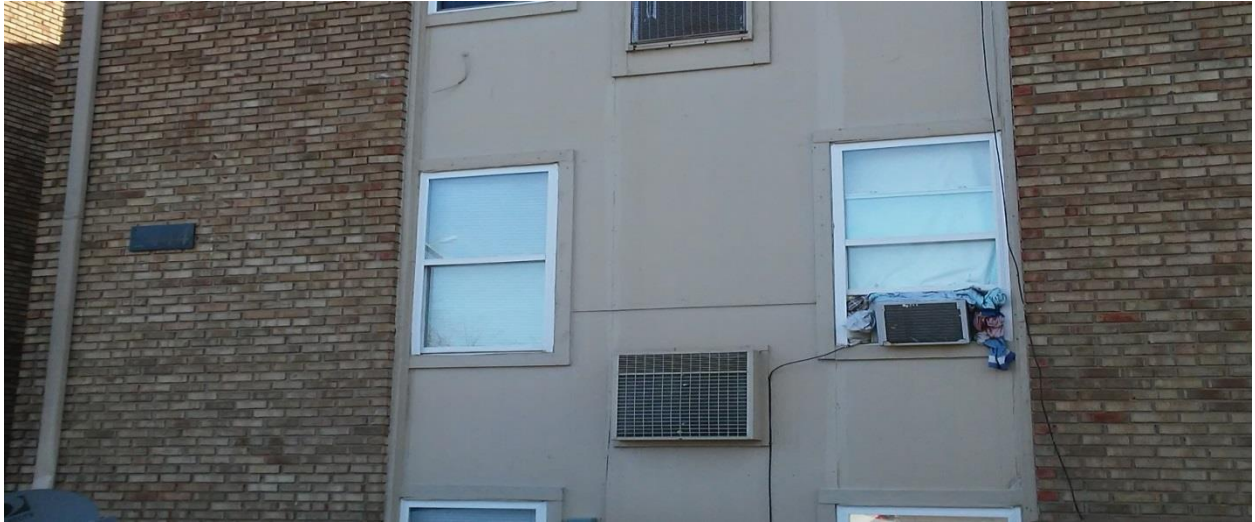
4224 Golden Gate Circle