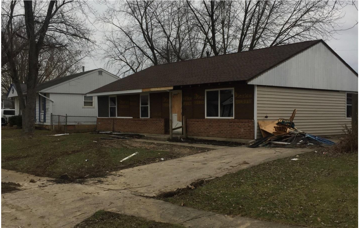
4228 Arbury Lane