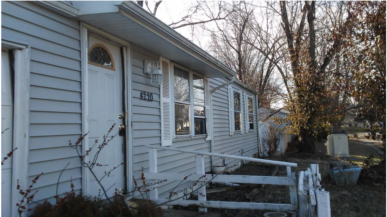
4220 Dunbridge St (front)