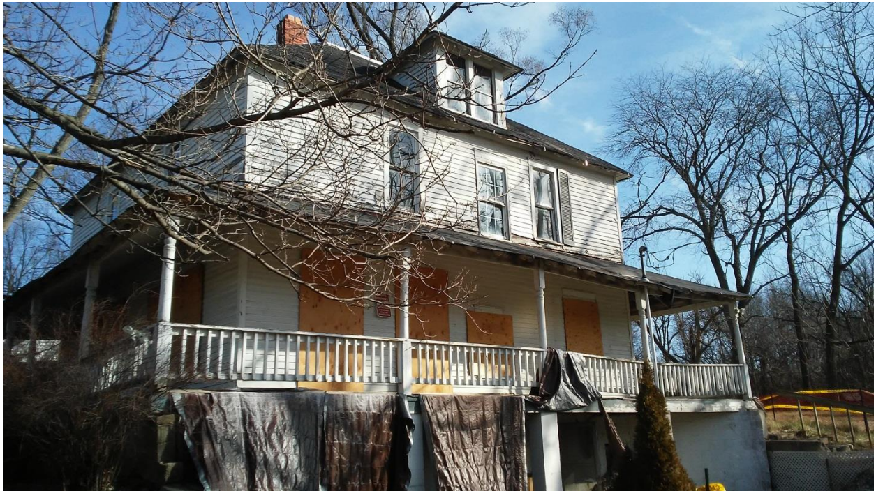
4130 Cleveland Avenue