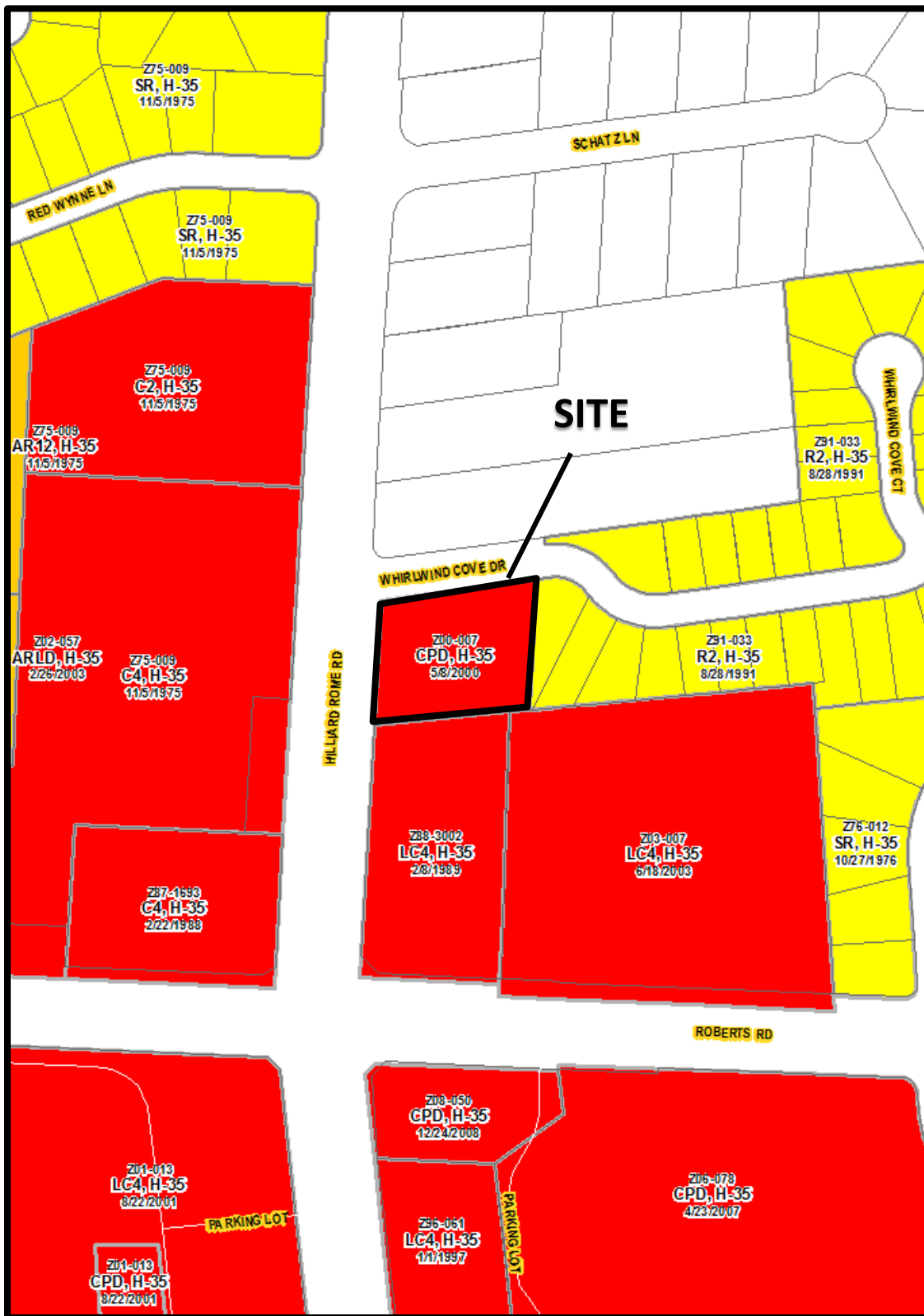
Z14-027 2636 Hilliard Rome Road Approximately 0.97 acres From CPD to LC-4