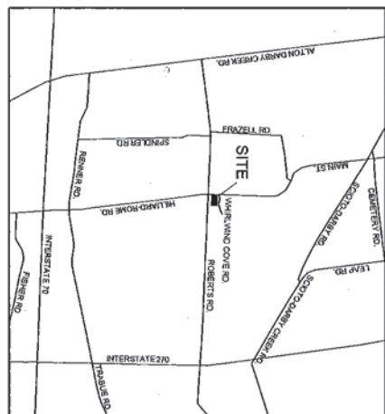
VICINITY MAP NO SCALE

OWNER: Pips Quick & Clean Car Wash, LLC 4501 W. Dublin-Granville Road Dublin, OH 43017 Ted Laakas 614-792-9900 Fax - 614-792-0476 tlaakas@midohio.tybc.com