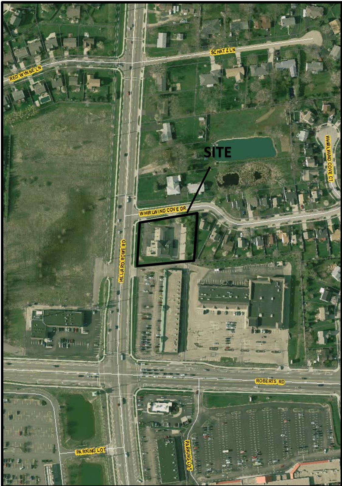
Z14-027 2636 Hilliard Rome Road Approximately 0.97 acres From CPD to L-C-4