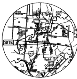
LOCATION MAP NOT TO SCALE