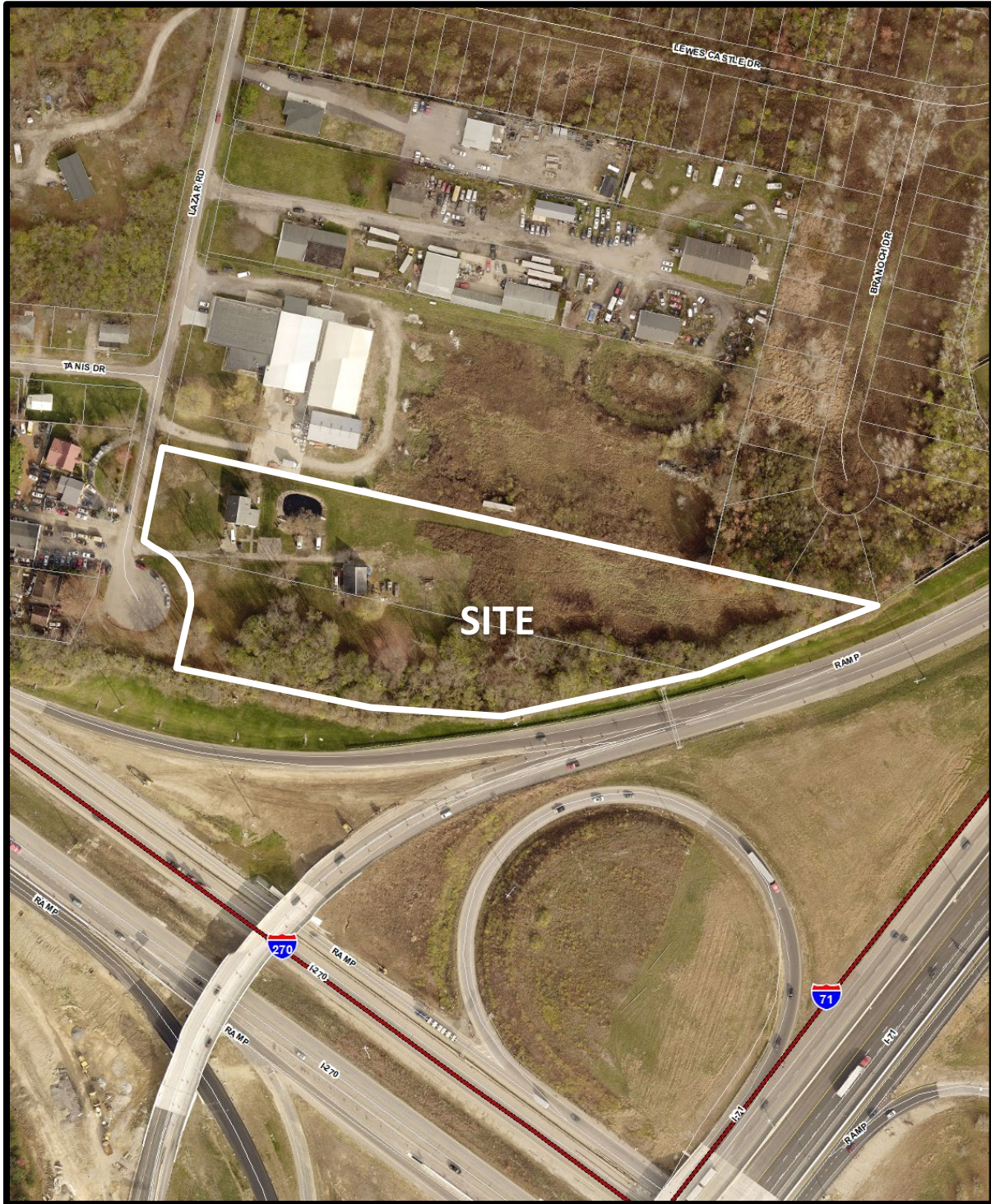
Z23-048 2976 Lazar Rd. Approximately 5.68 acres L-M-2 to L-M-2