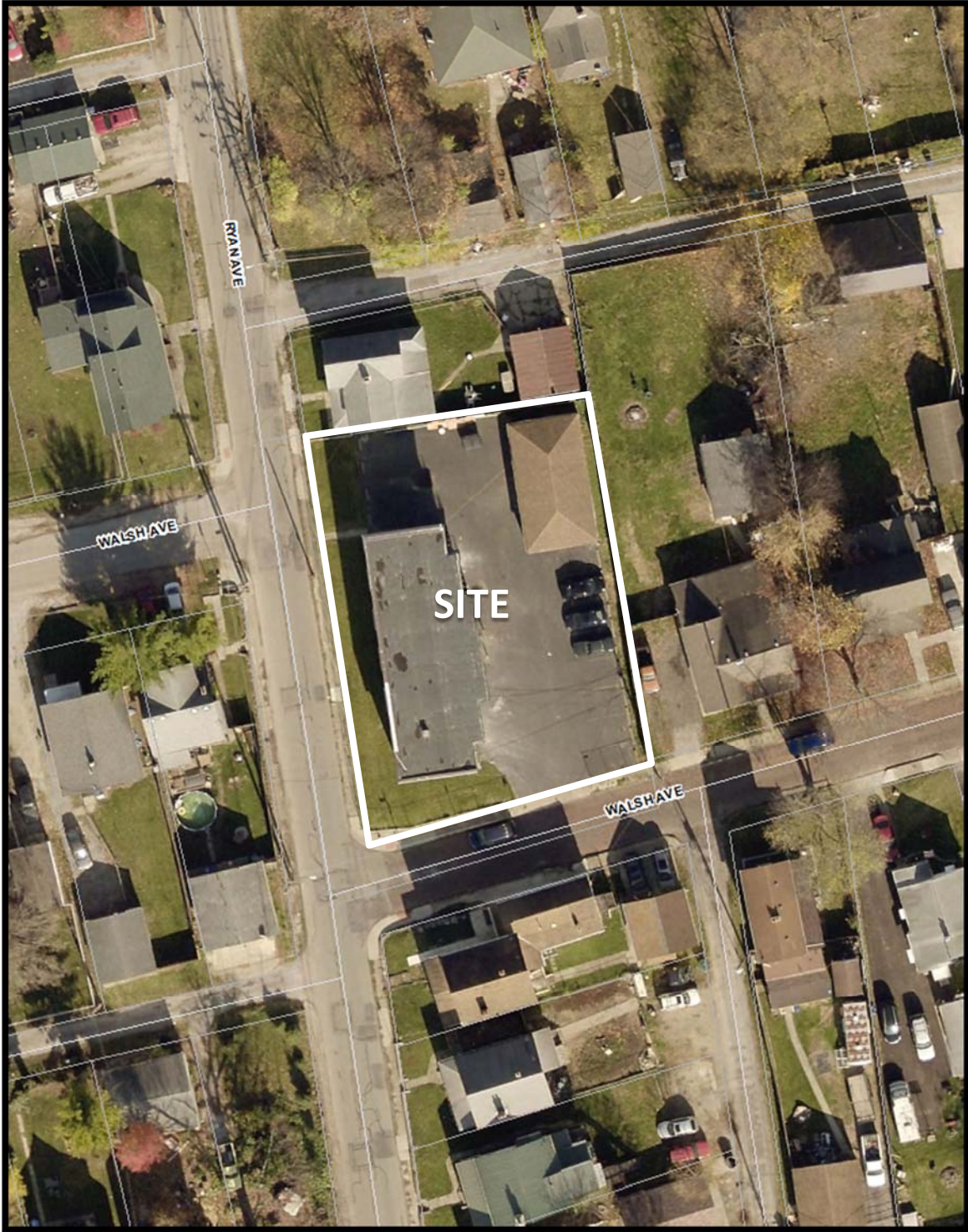
CV22-034 478 Ryan Ave. Approximately 0.40 acres