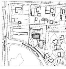
SITE LOCATION LEGEND: DATE: 11/17/03