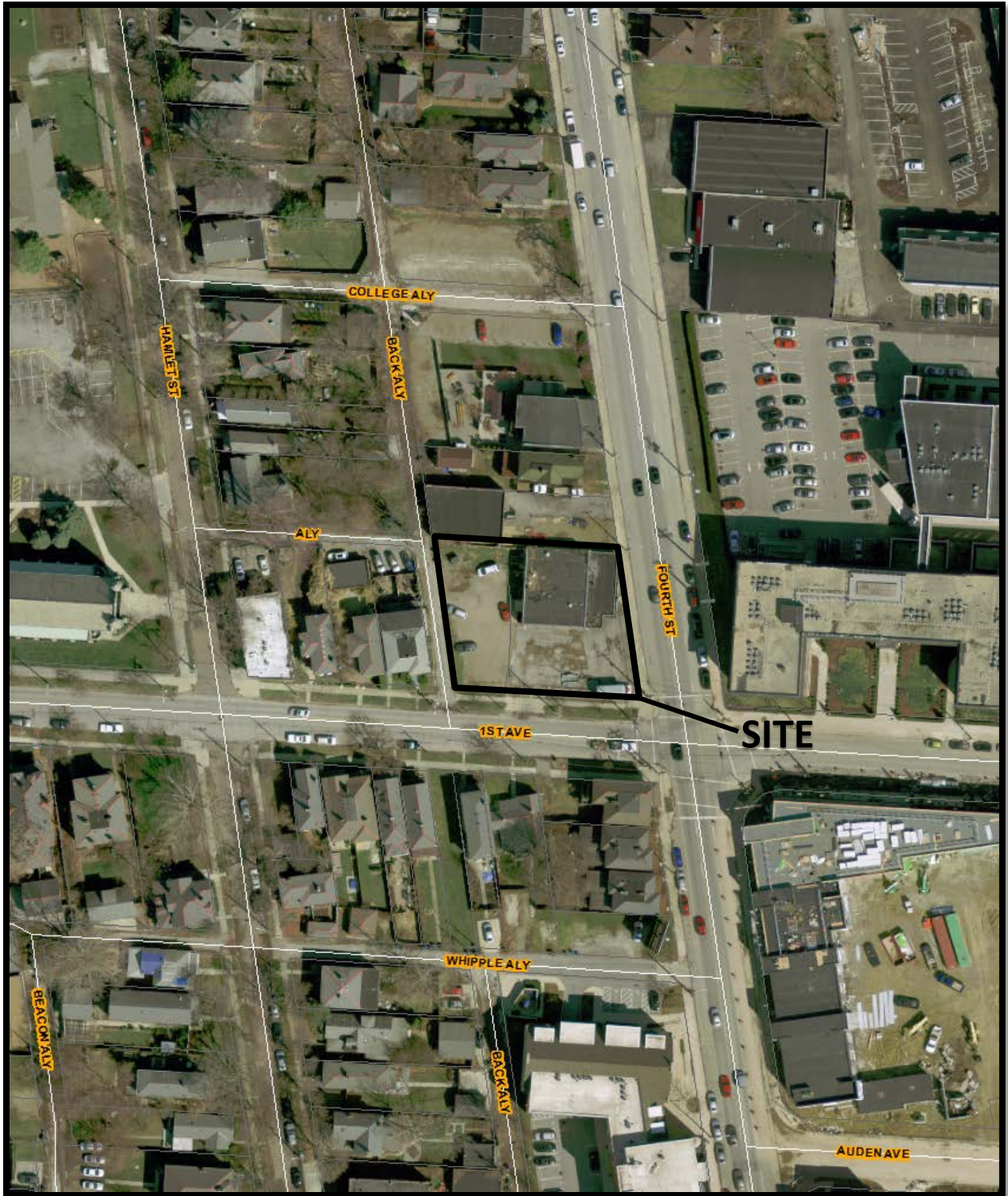
CV17-062 875 North Fourth Street Approximately 0.35 acres