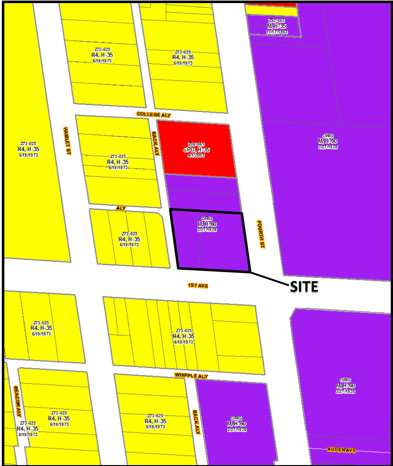
CV17-062 875 North Fourth Street Approximately 0.35 acres