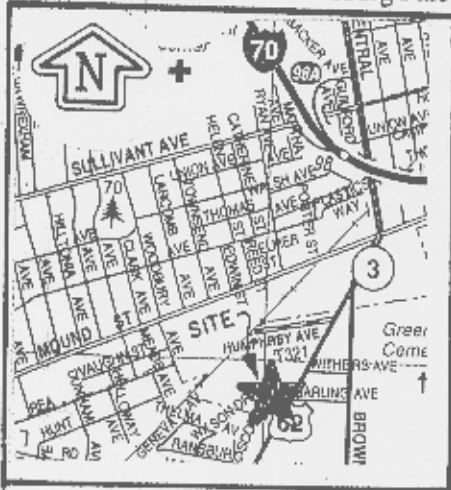
VICINITY MAP nts