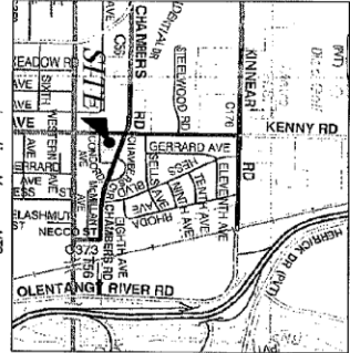
Location Map - NTS