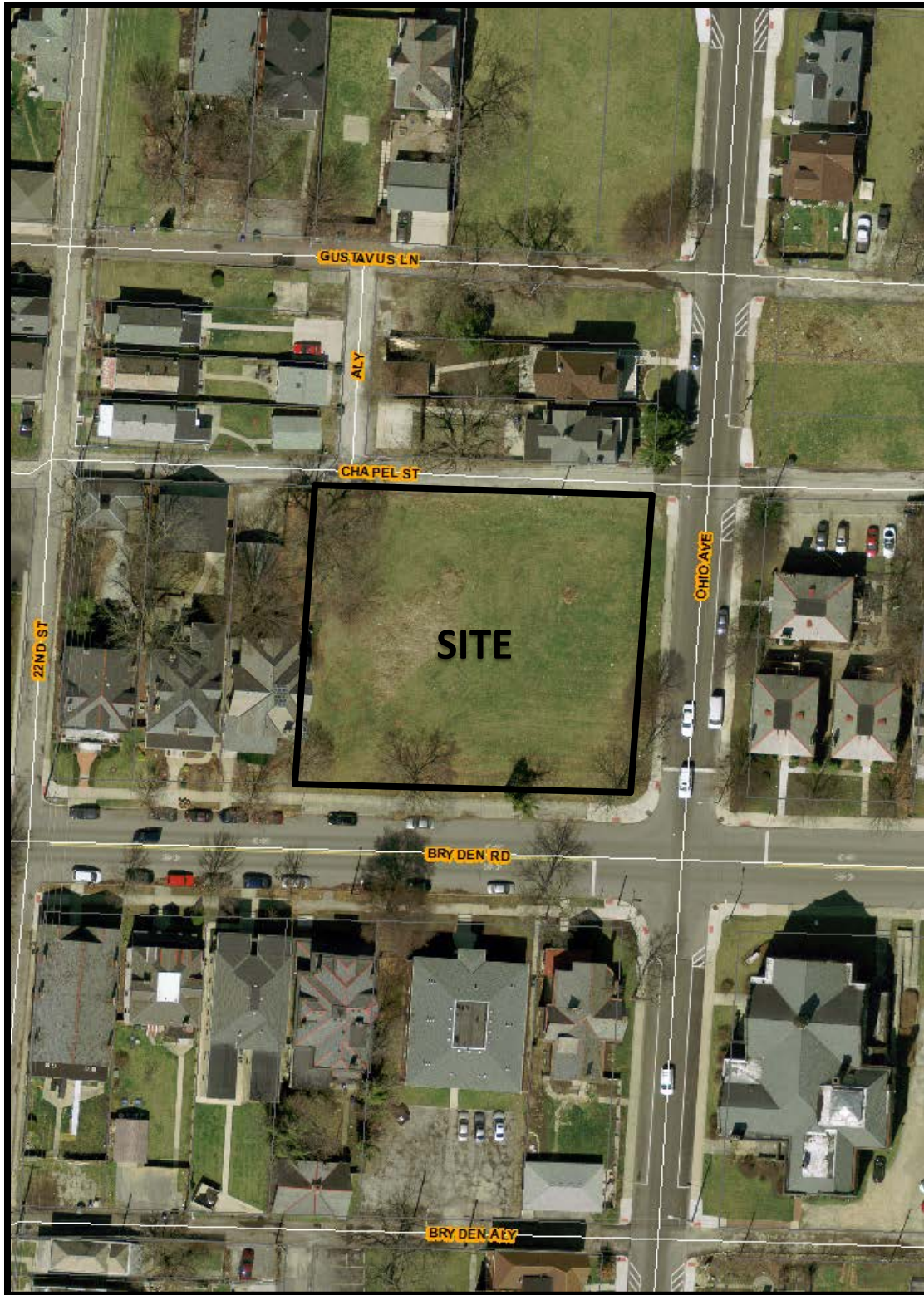
CV17-022 1080 Bryden Road Approximately 0.62 acres