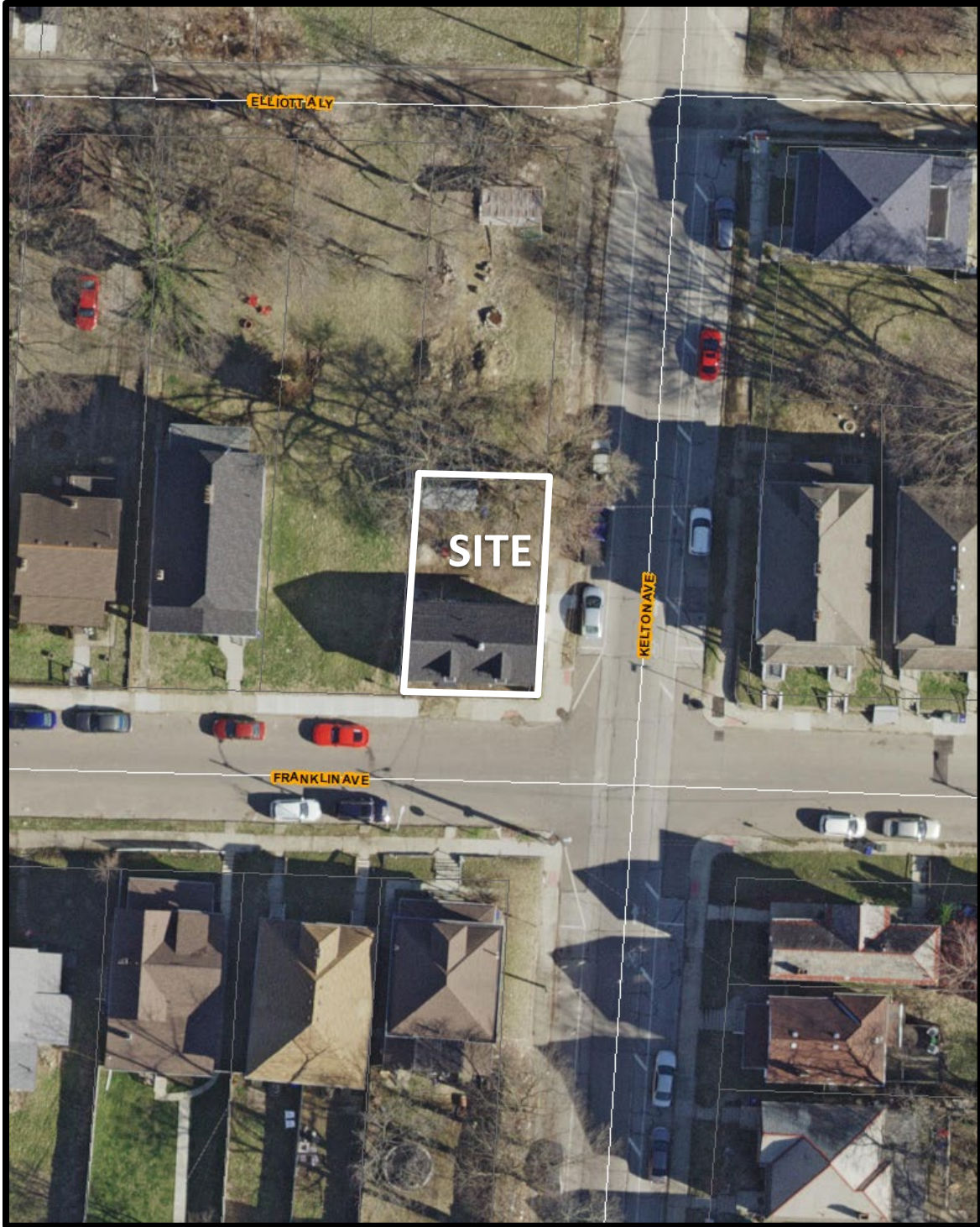
CV21-041 267 Kelton Ave. Approximately 0.05 acres