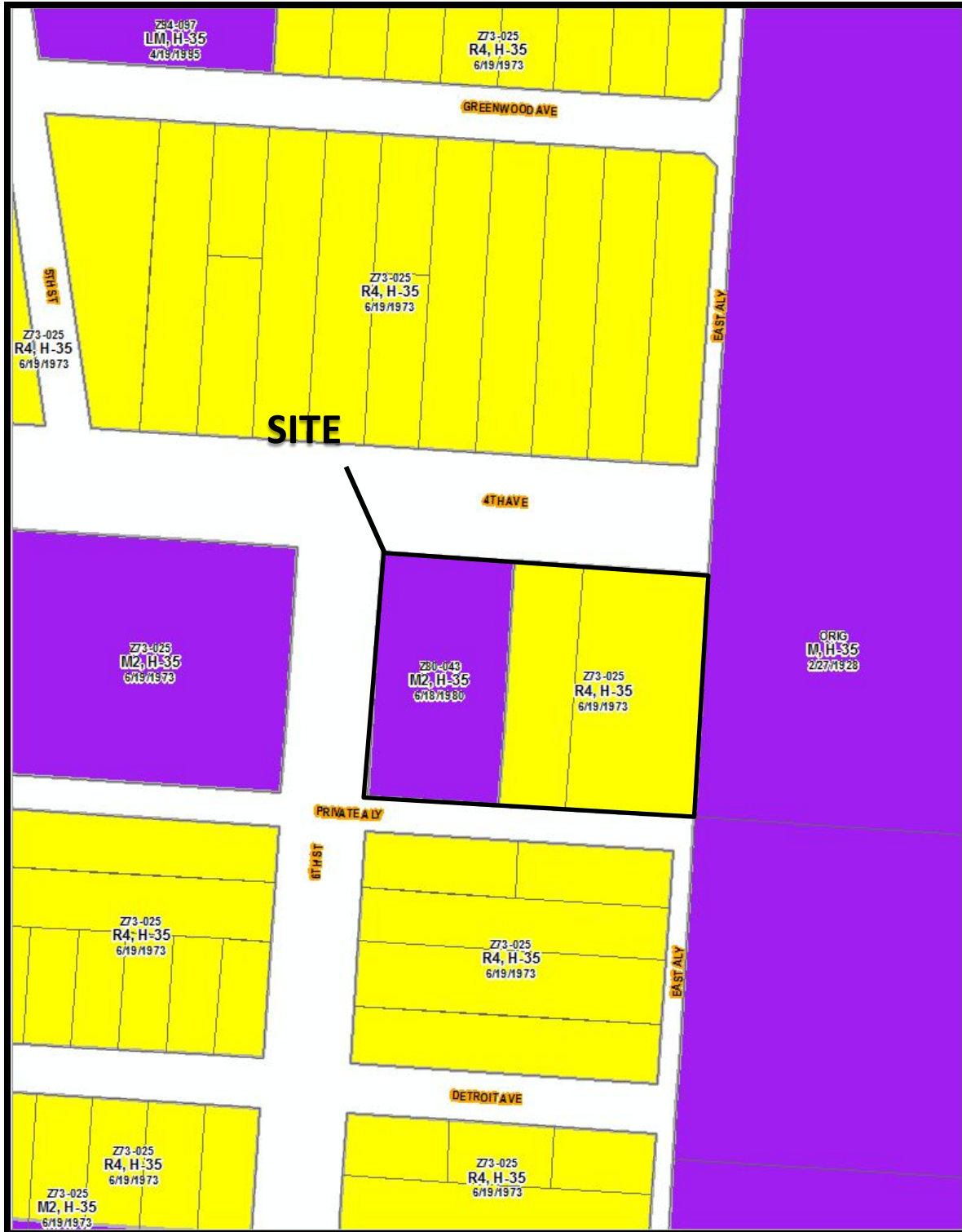
Z15-016 285 & 295 East Fourth Avenue Approximately 0.61 acres R-4 and M-2 to AR-2