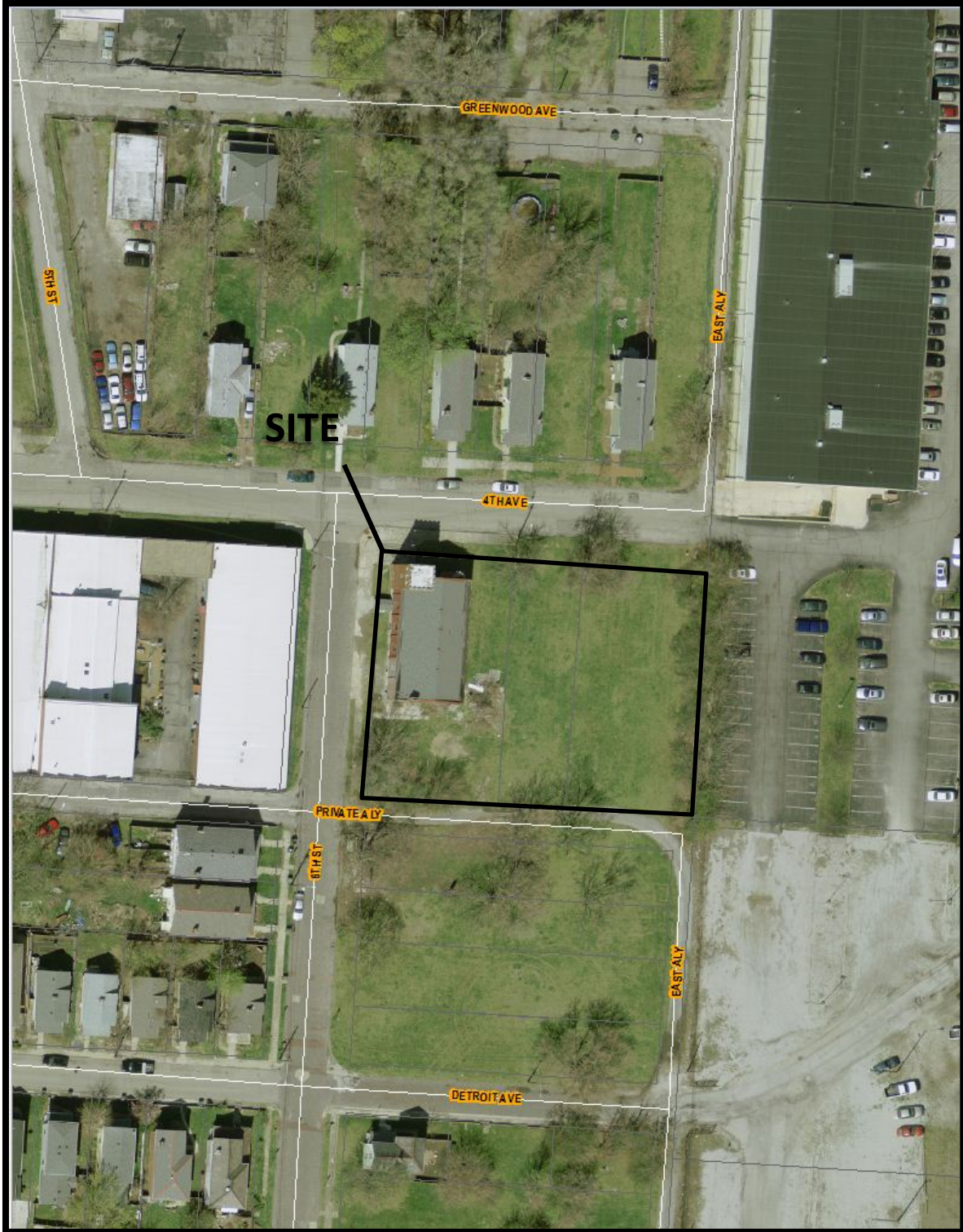
Z15-016 285 & 295 East Fourth Avenue Approximately 0.61 acres R-4 and M-2 to AR-2