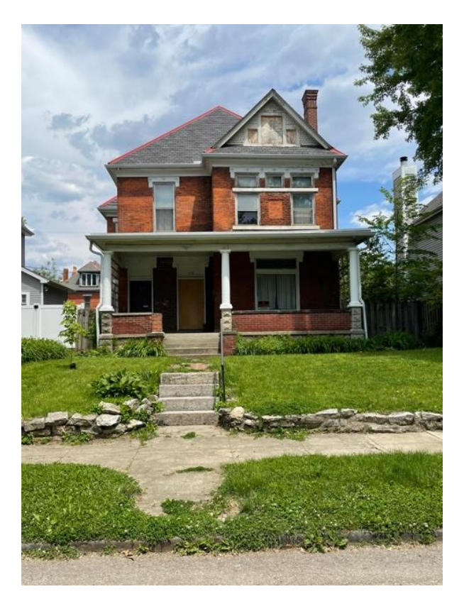
470 W 4<sup>th</sup> Ave