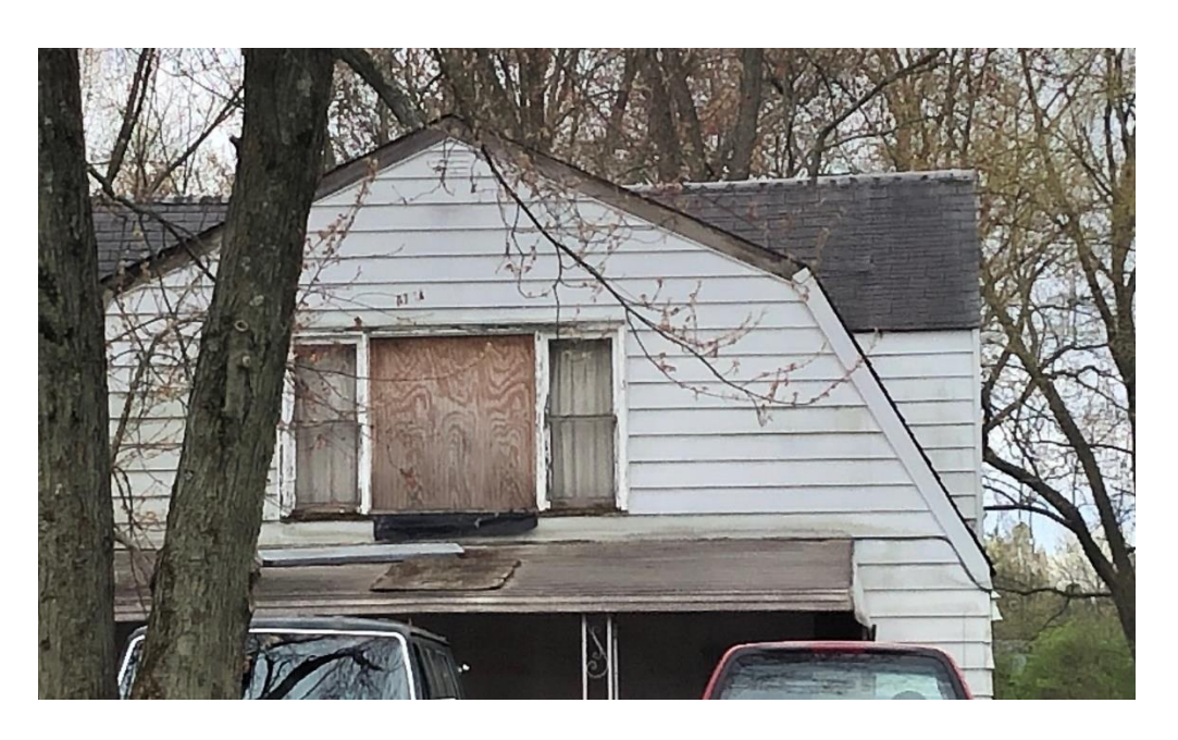
1231 Home Acre Dr