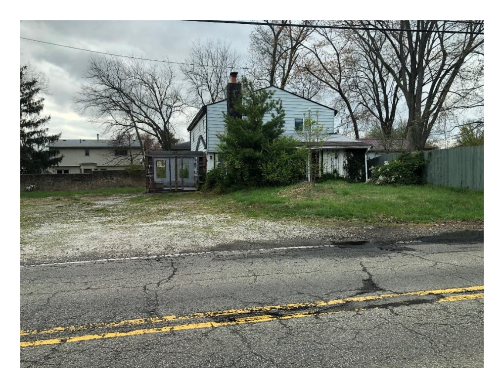
6761Maple Canyon Ave