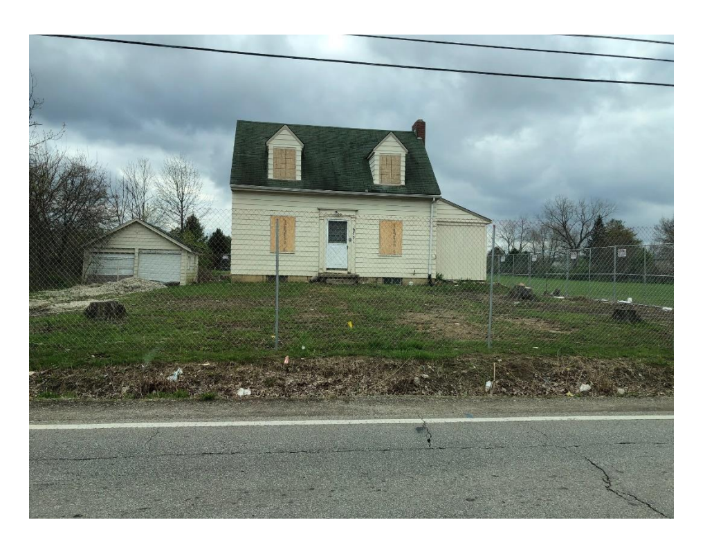
5771 Maple Canyon Ave.