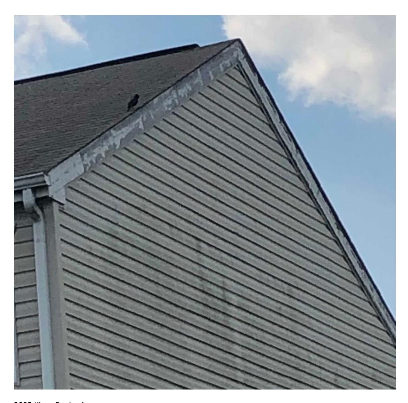
3095 Kings Realm Ave