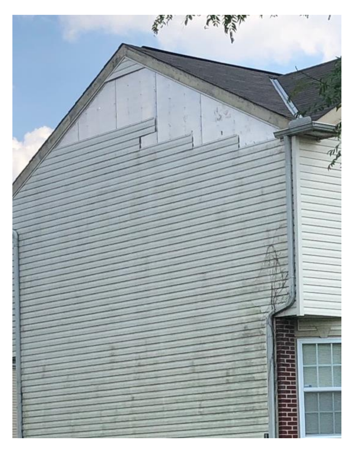
3344 Kady Ln