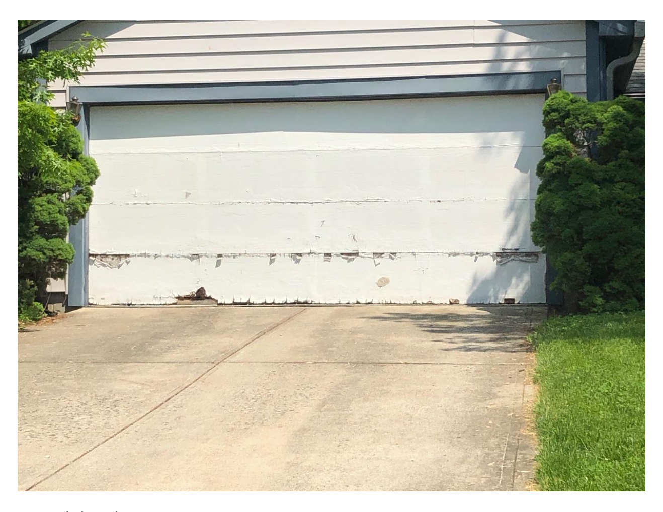
5405 Paladim Rd