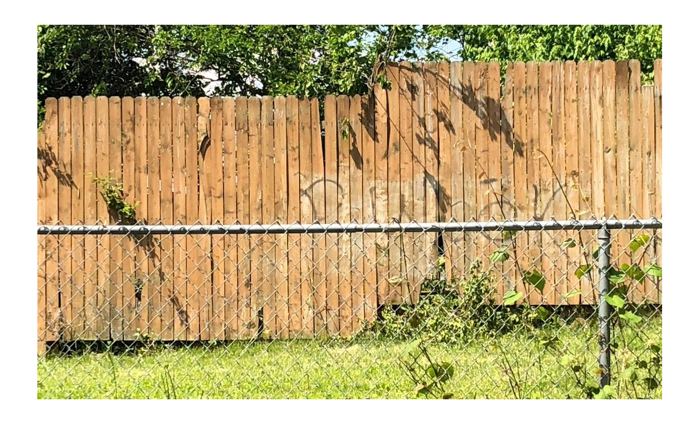
5378 Paladim Rd