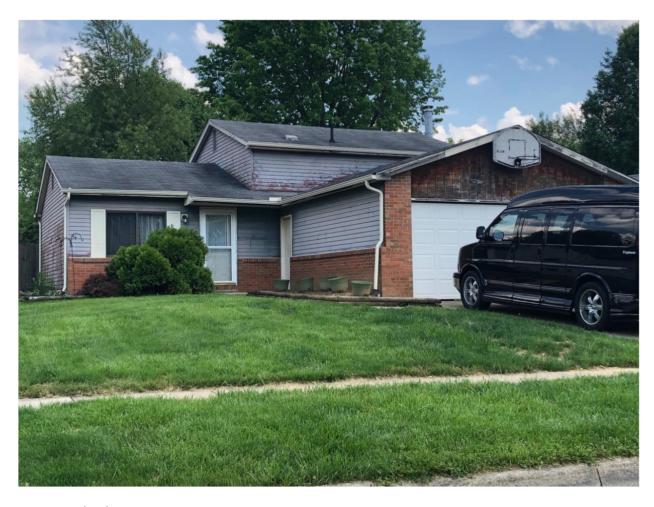
2994 Fox Chaple Dr