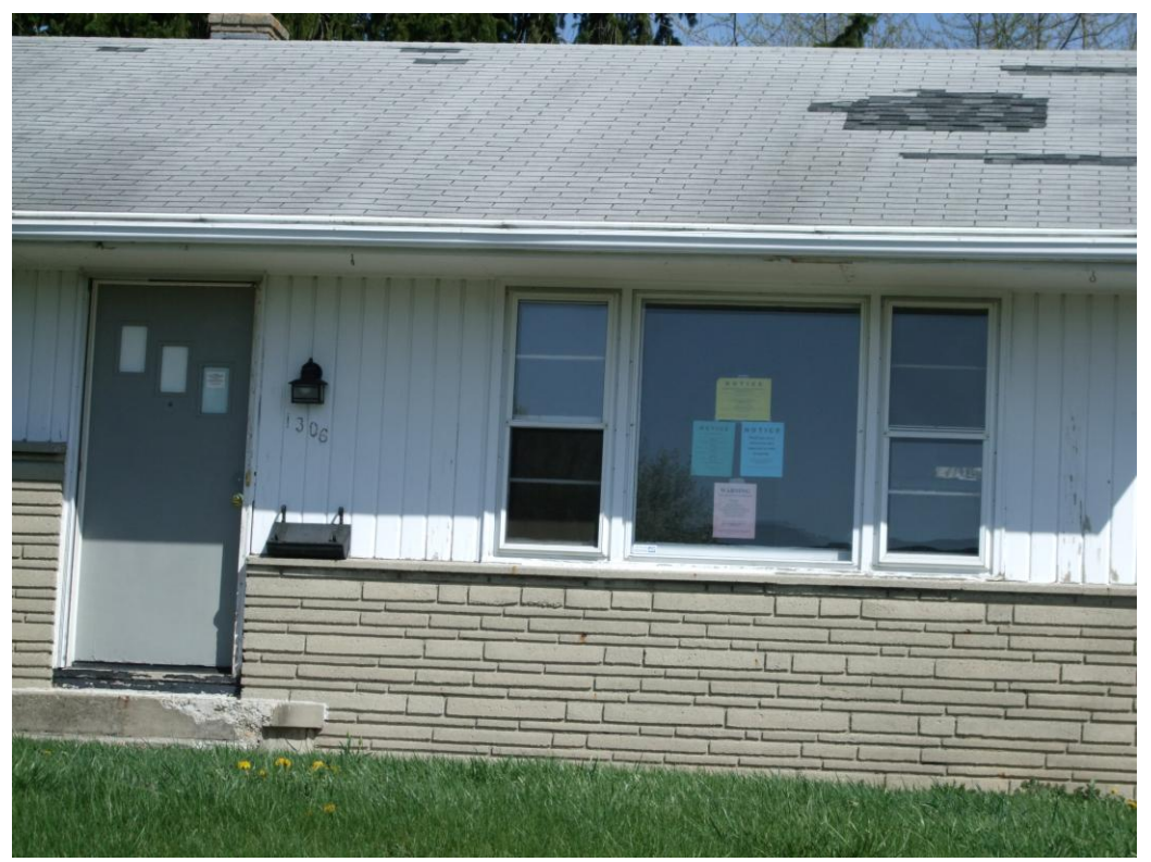
Located immediately adjacent to the proposed Commons at Livingston Supportive Housing Project (Please Note the hole in the roof)