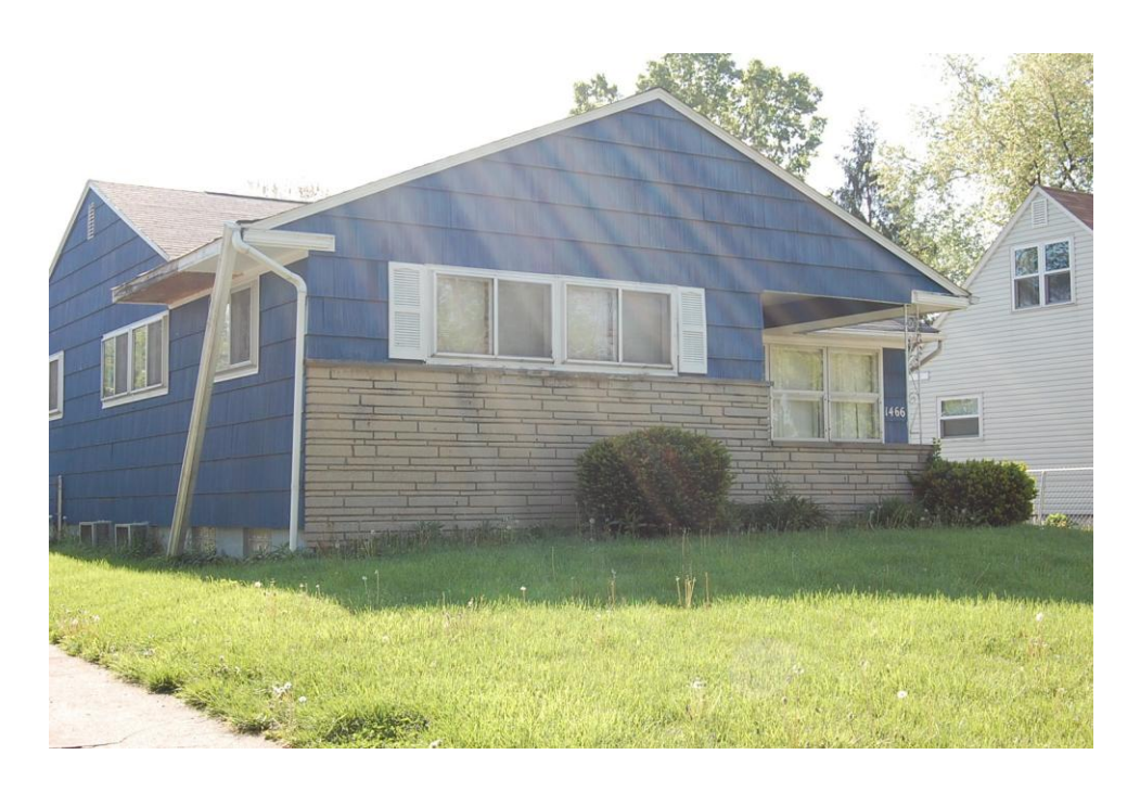
1396 Byron (Note vacancy signage in the window)