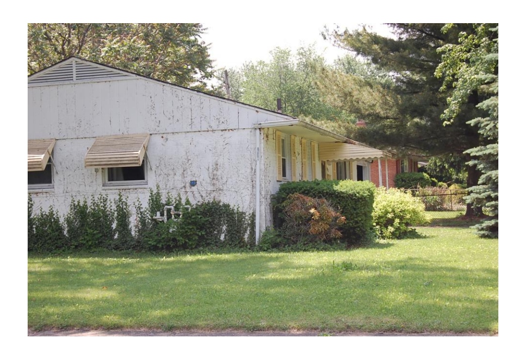
3588 Bolton (note vacancy signage in the windows- HUD owned)