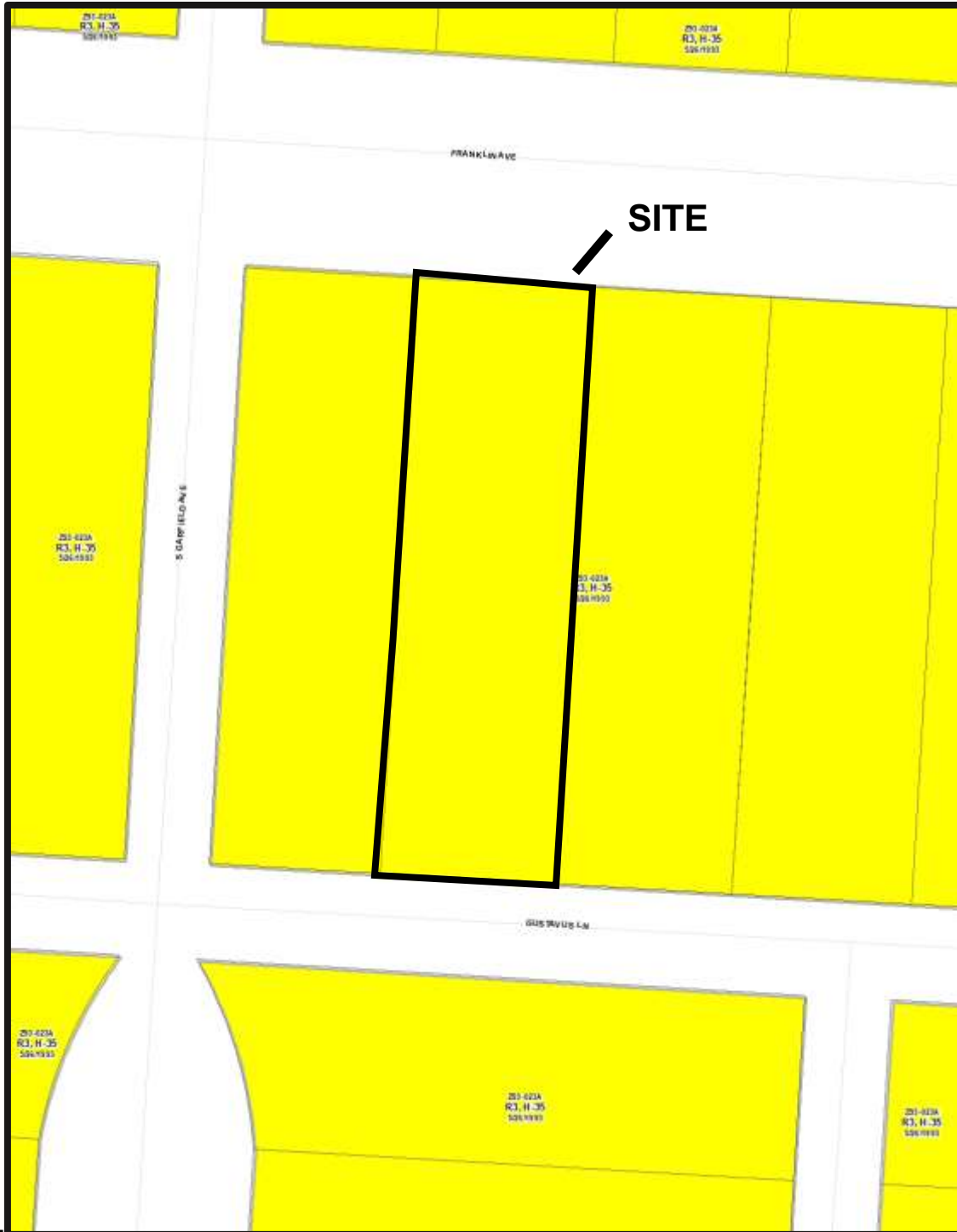
CV22-021 761 Franklin Ave. Approximately 0.12 acres