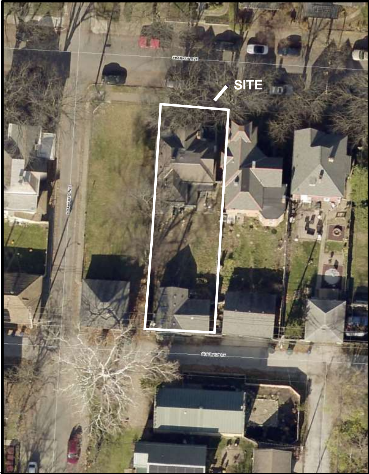
CV22-021 761 Franklin Ave. Approximately 0.12 acres