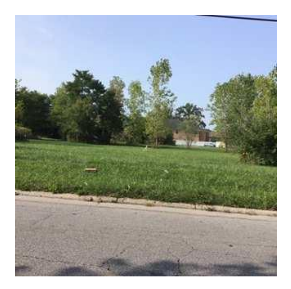
Vacant Lot across from 975 North Meadows