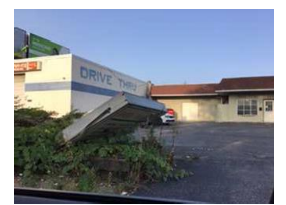
5311 Sinclair Rd