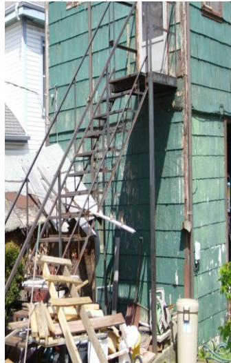
135 W. Second Ave (rear of property)