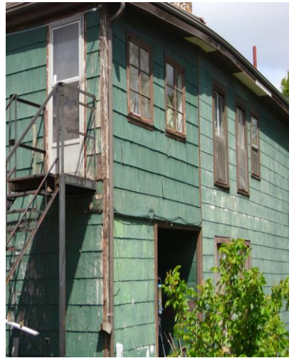
135 W. Second Ave (side view)