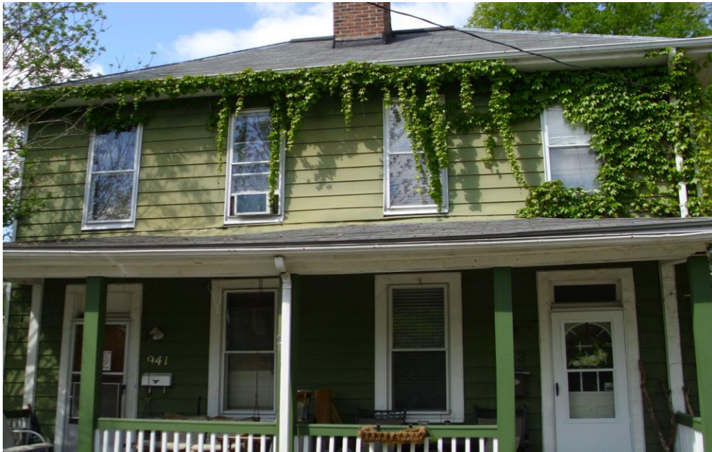
941-943 Hunter Avenue