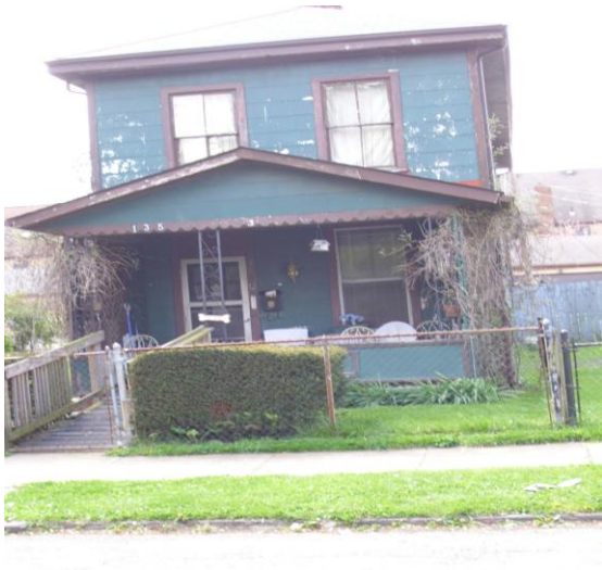
135 W. Second Ave (front)