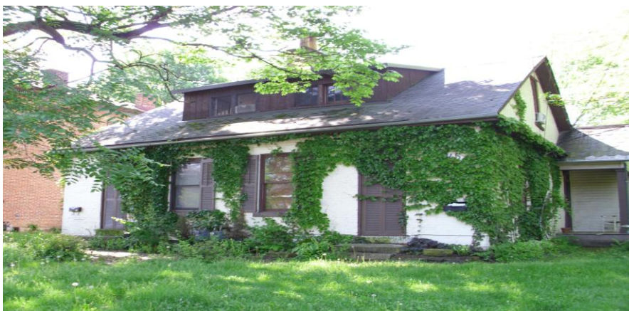
45-47 First Avenue