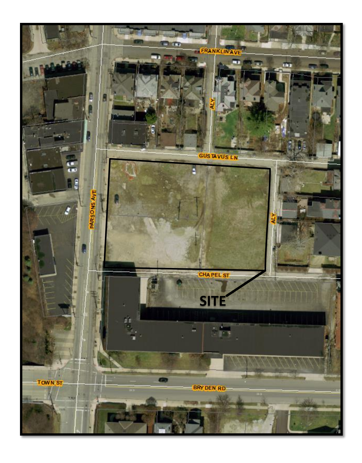
CV16-017A 136 Parsons Avenue Approximately 1.09 acres