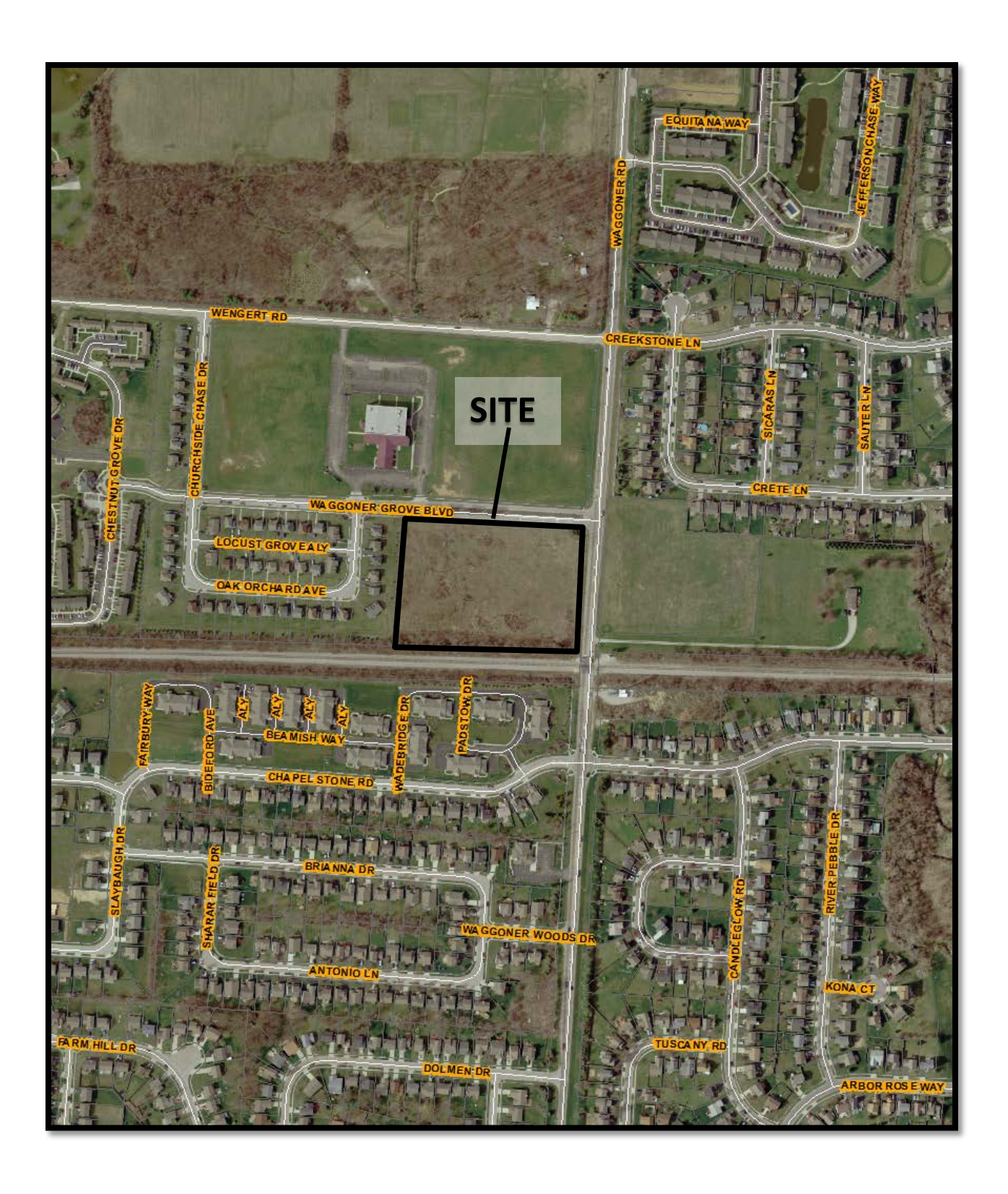
Z00-052B 7501 Wengert Road (711 North Waggoner Road) Approximately 5.67 acres