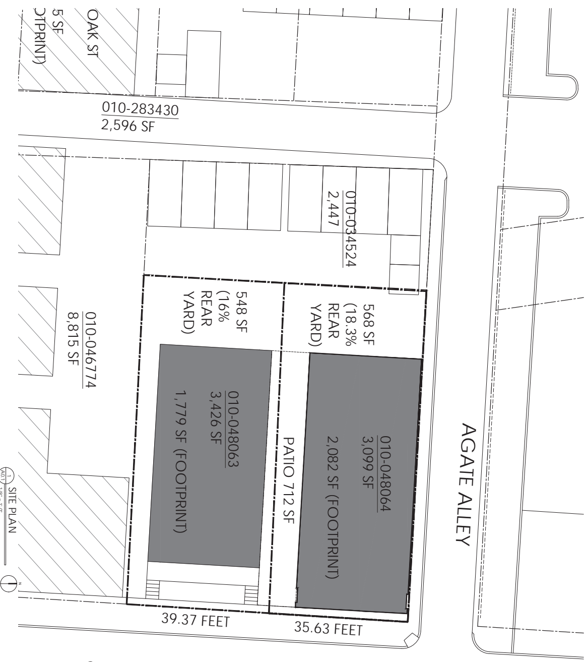
S 18th STREET