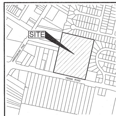
LOCATION MAP AND BACKGROUND DRAWING Not to Scale

This annexation does not create islands of unincorporated areas within the limits of the area to be annexed.