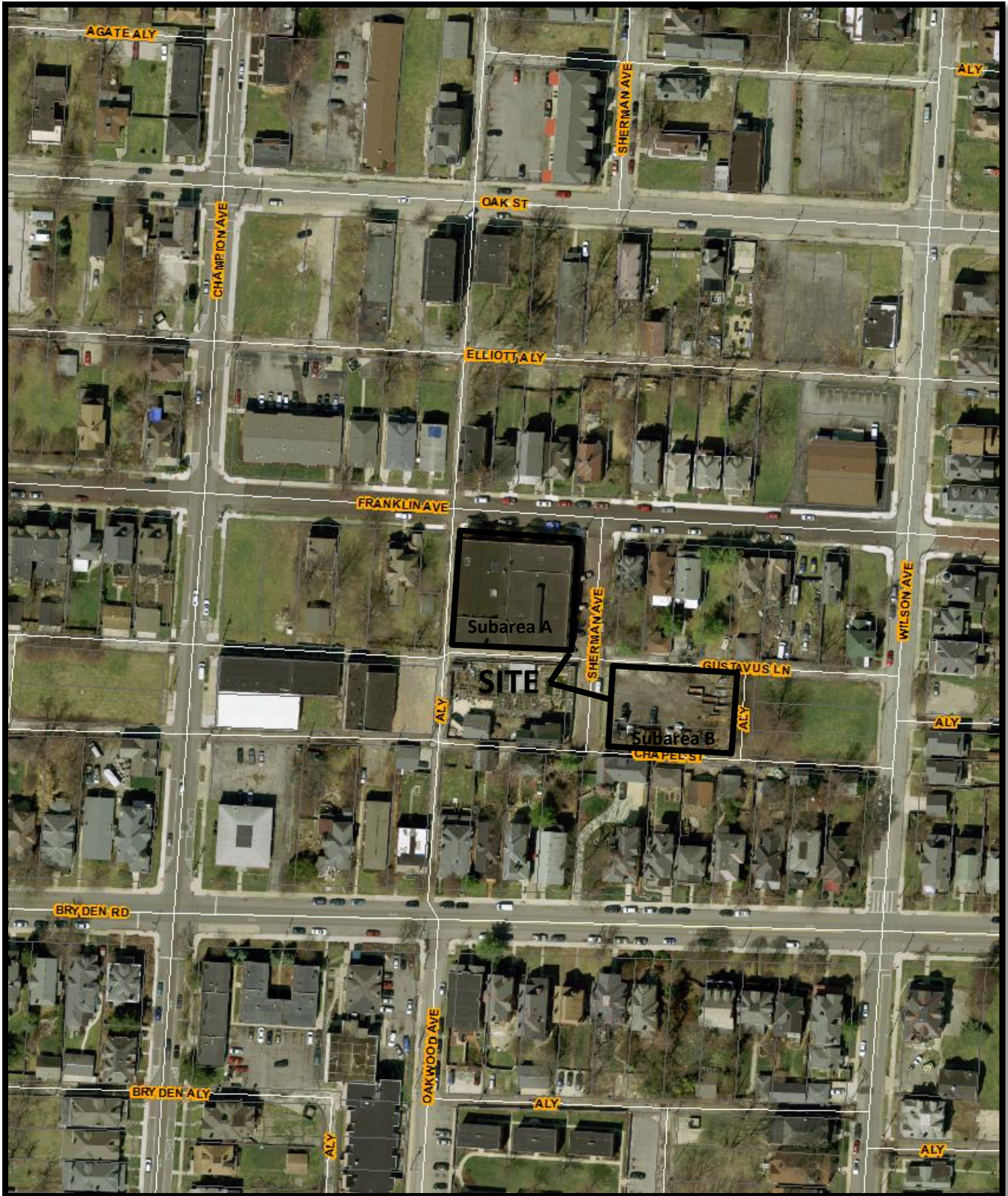
CV17-076 1199 Franklin Avenue Approximately 0.7 acres