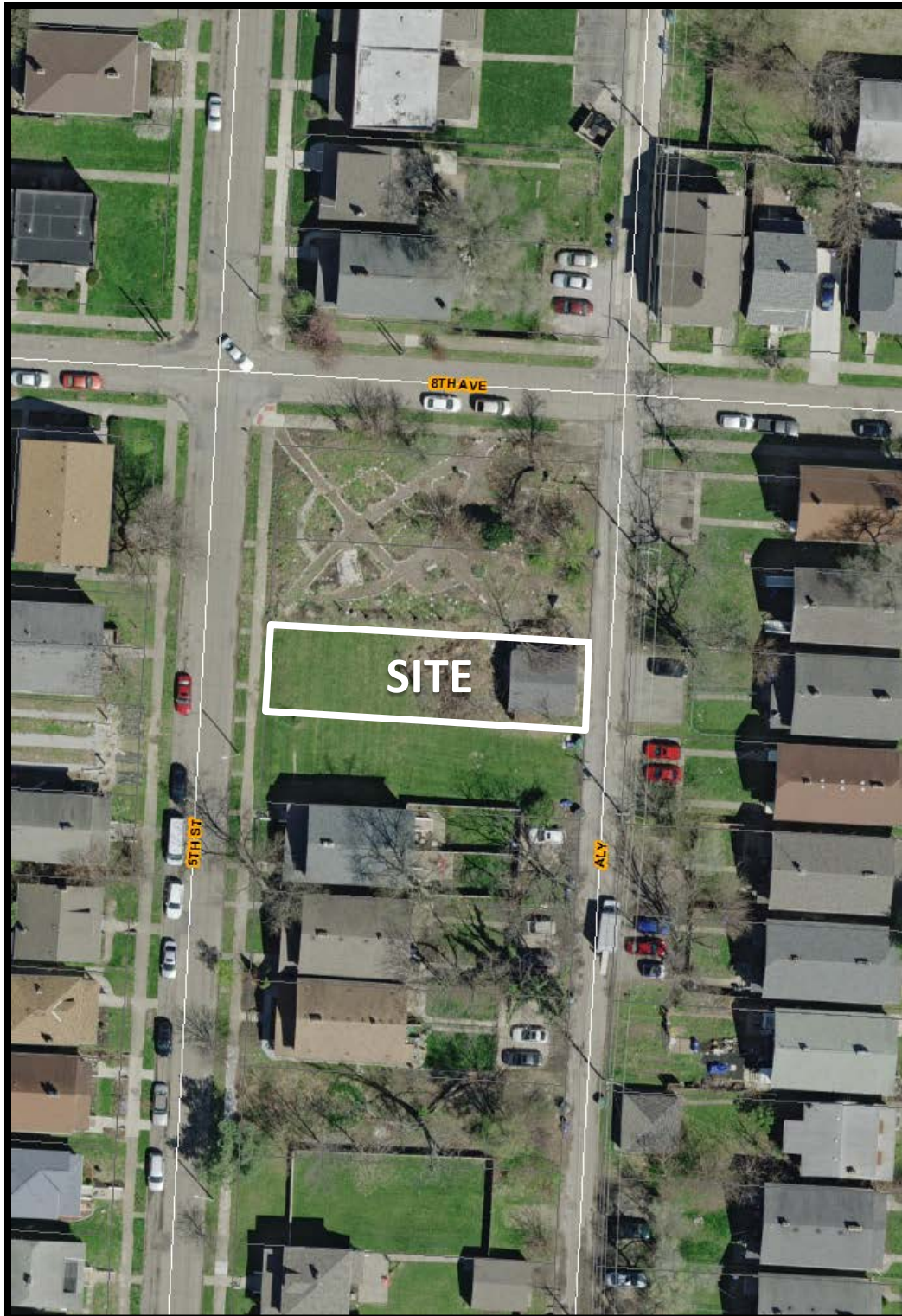
CV19-001 1374 North Fifth Street Approximately 0.10 acres