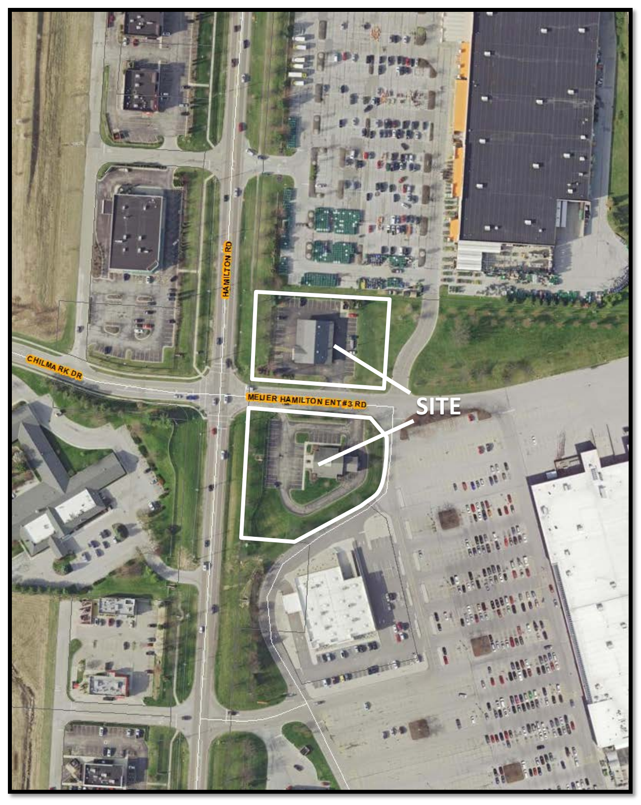
Z90-166E 5150 North Hamilton Road L-C-4 Approximately 2.5 acres