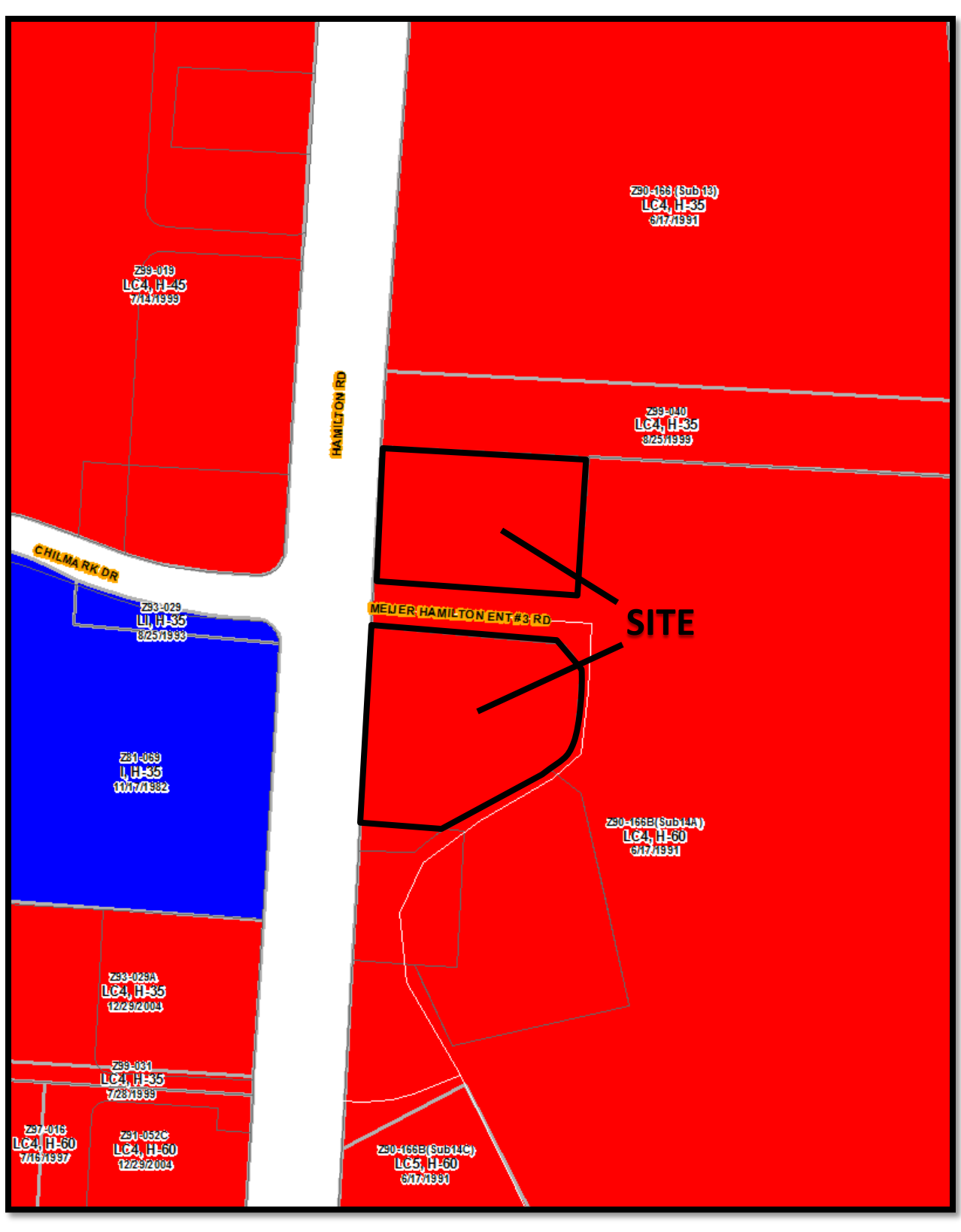
Z90-166E 5150 North Hamilton Road L-C-4 Approximately 2.5 acres