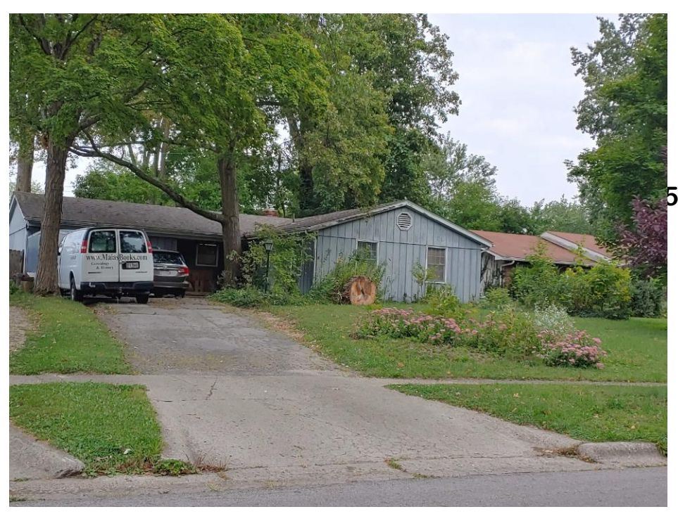
5438 Sinclair Rd