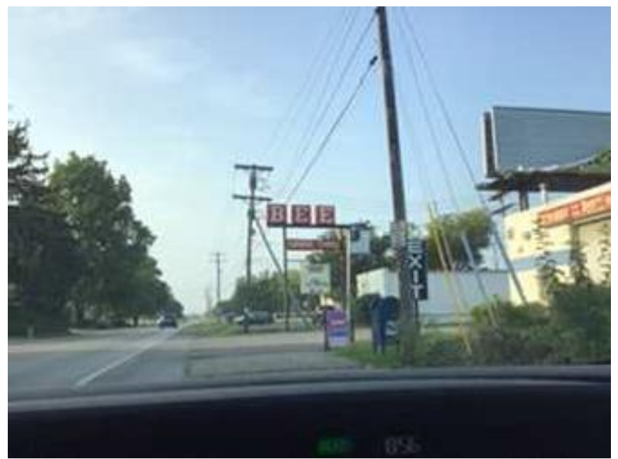
5331 Sinclair RD