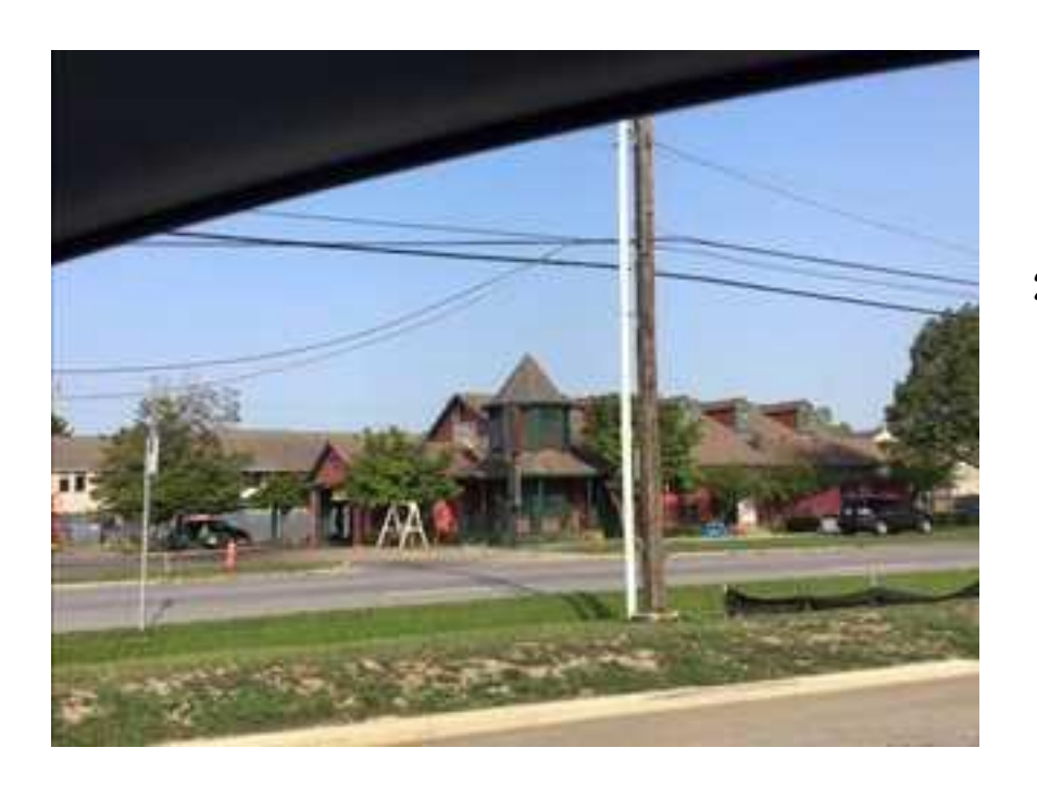
2882 Sinclair Rd,