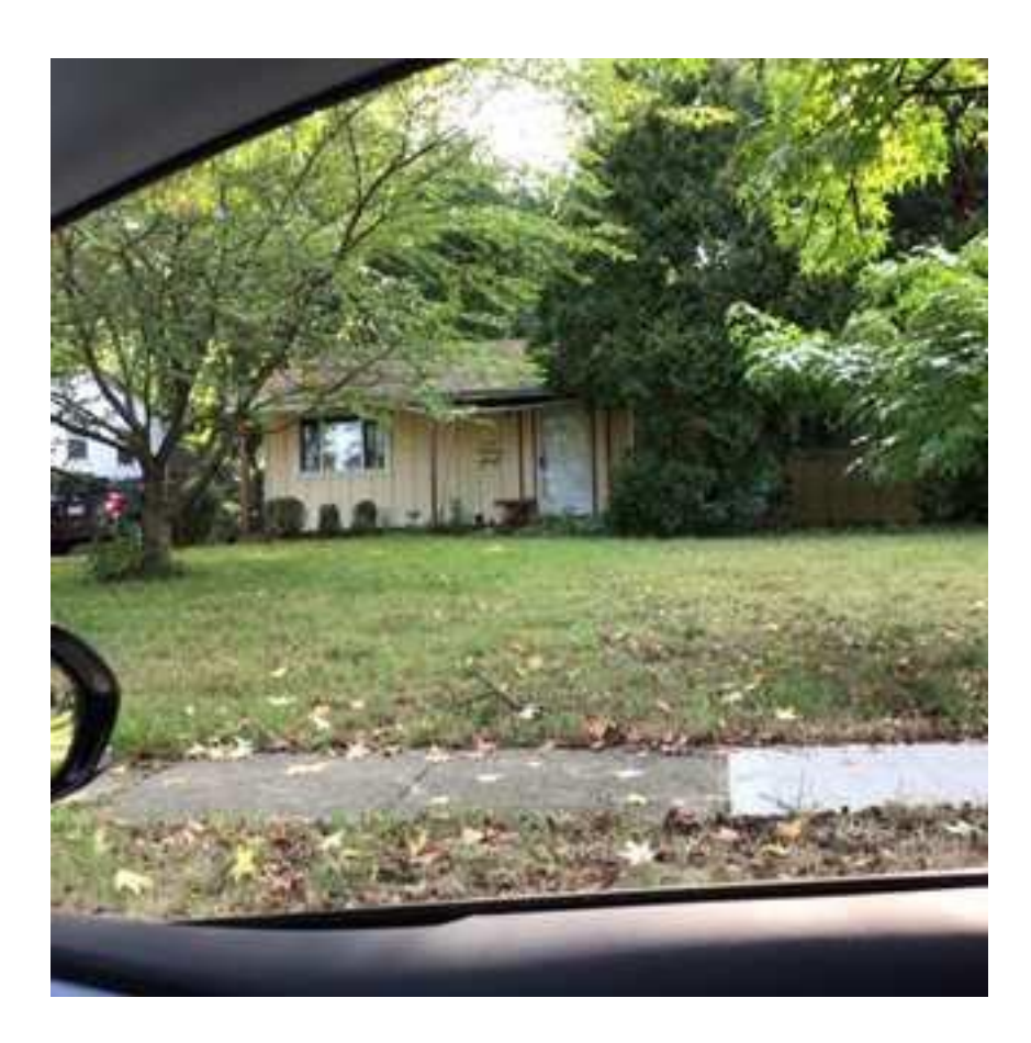
5724 North Meadows