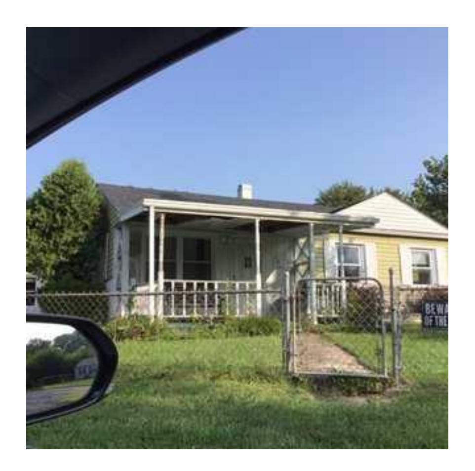
5772 North Meadows